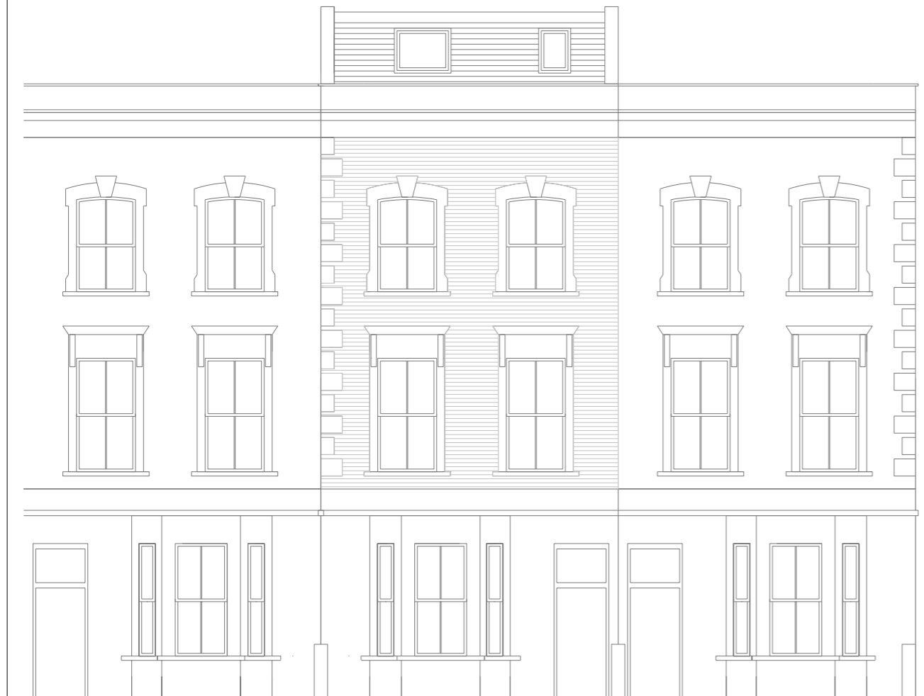
FRONT ELEVATION 01