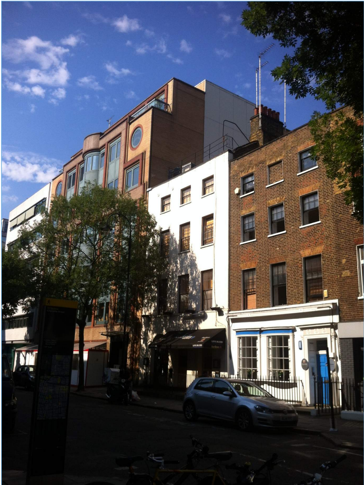
Figure 18 - Buildings (from right to left) at 72-78 Charlotte Street from south-western side of Charlotte Street (within the Conservation Area)