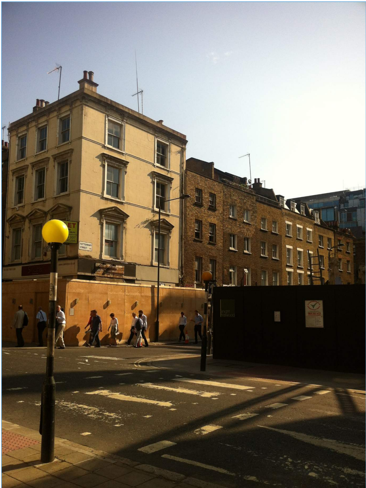
Figure 17 - The south west corner of Charlotte Street & Tottenham Street from 64 Charlotte Street (within the Conservation Area)