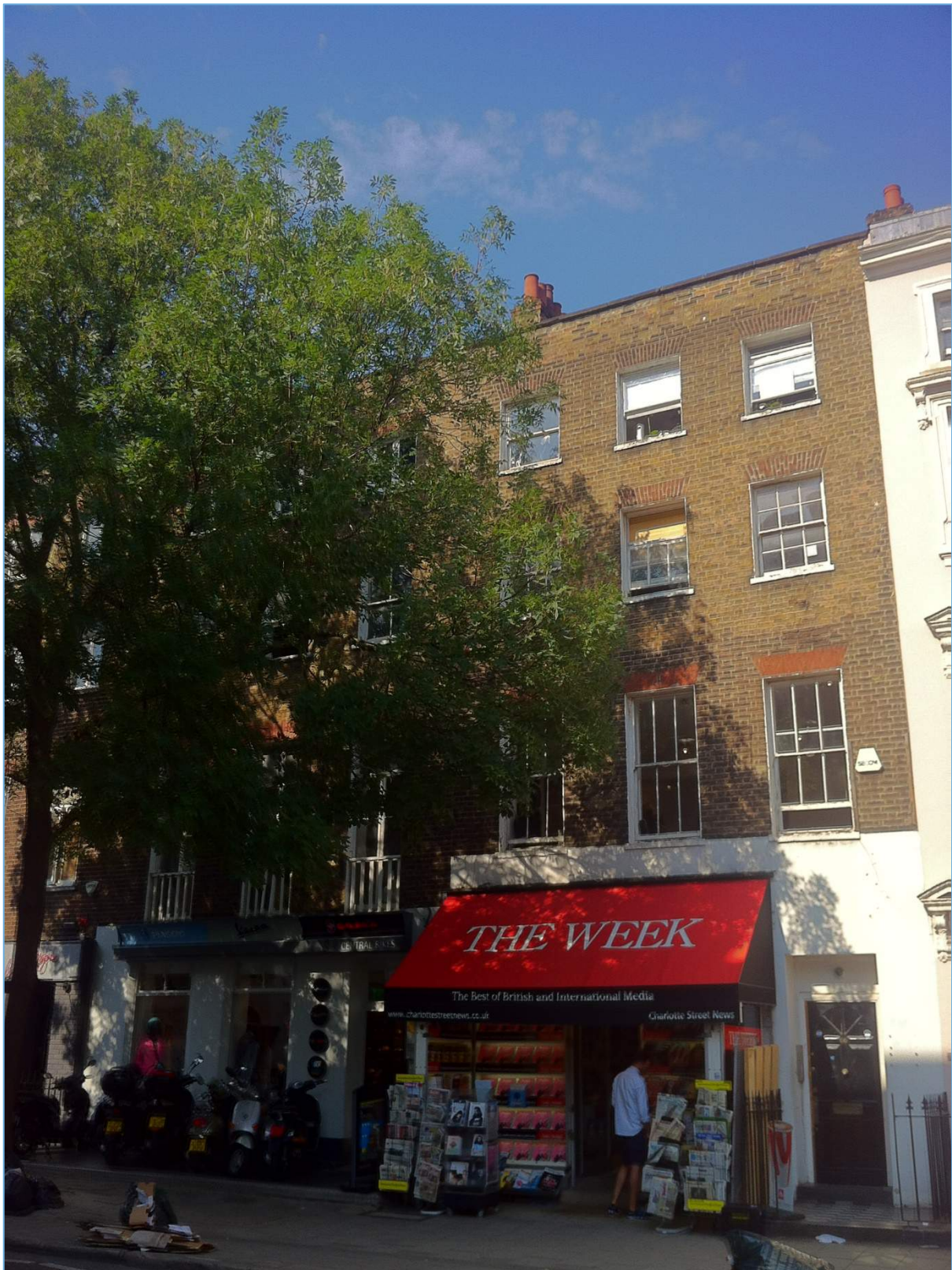
Figure 20 - Neighbouring buildings at 66-68 Charlotte Street with 64 Charlotte Street shown on the right edge of the photograph.