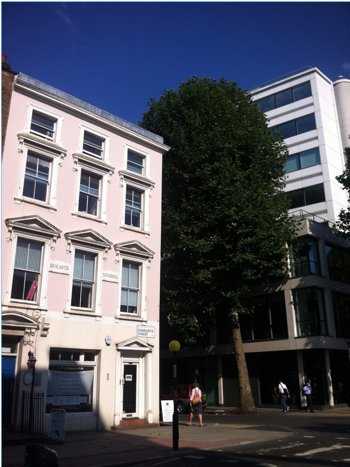
Figure 15 - Photo of the Corner of Charlotte Street and Tottenham St from the Northwest