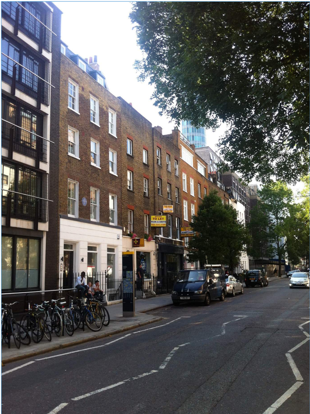
Figure 19 - Buildings on the north-western side of Charlotte Street (numbers 77-97) from 64 Charlotte Street. (Within the Conservation Area)