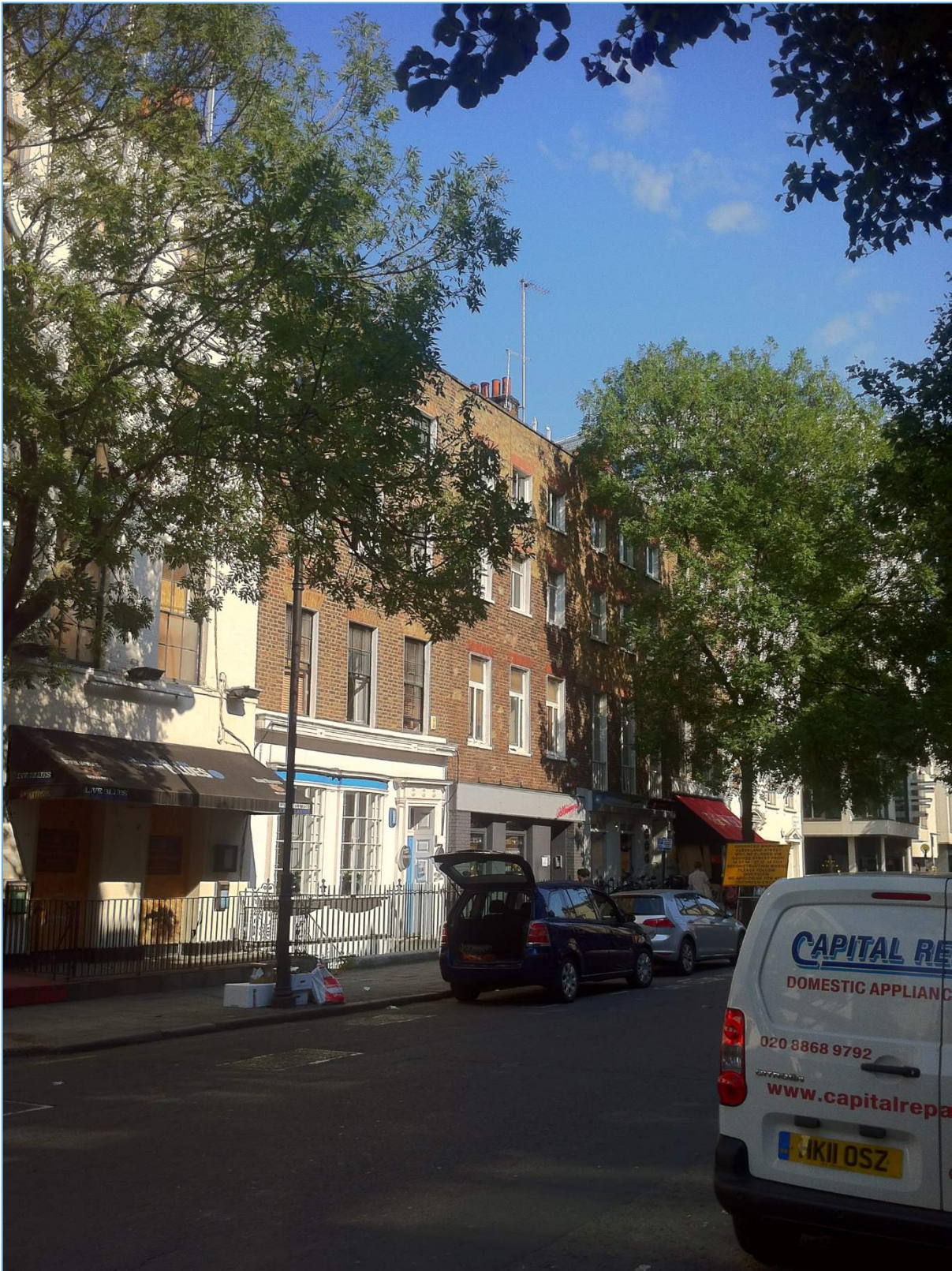
Figure 21 - View of the buildings at 64-74 (right to left) Charlotte Street. The view is from the North-west side of Charlotte Street. There is considerable tree cover of the buildings from the northern end of Charlotte Street.