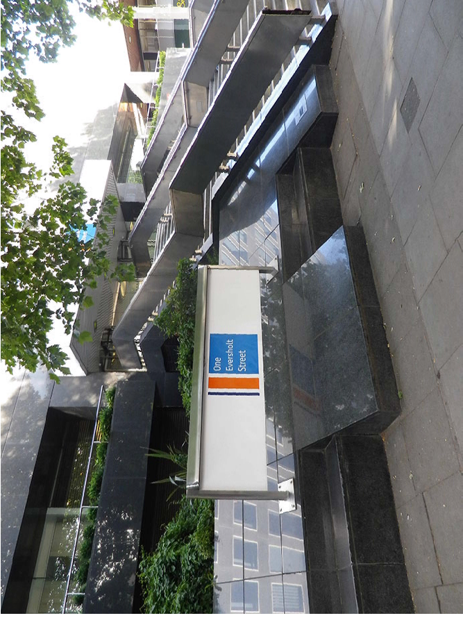
Photo of existing illuminated signage