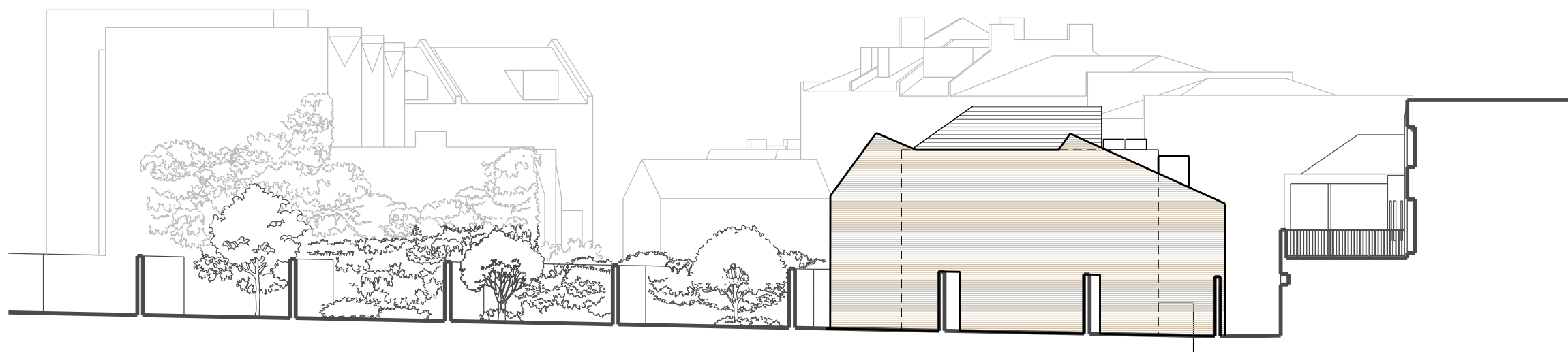
PROPOSED SIDE ELEVATION FROM GARDENS IN LADY SOMERSET ROAD - 1:200 @ A3

OUTLINE OF PROPOSED BUILDING BEHIND WALL