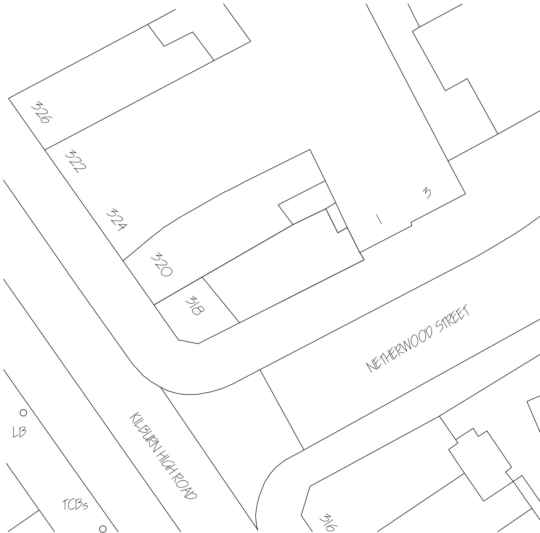
BLOCK PLAN ~ 1:200