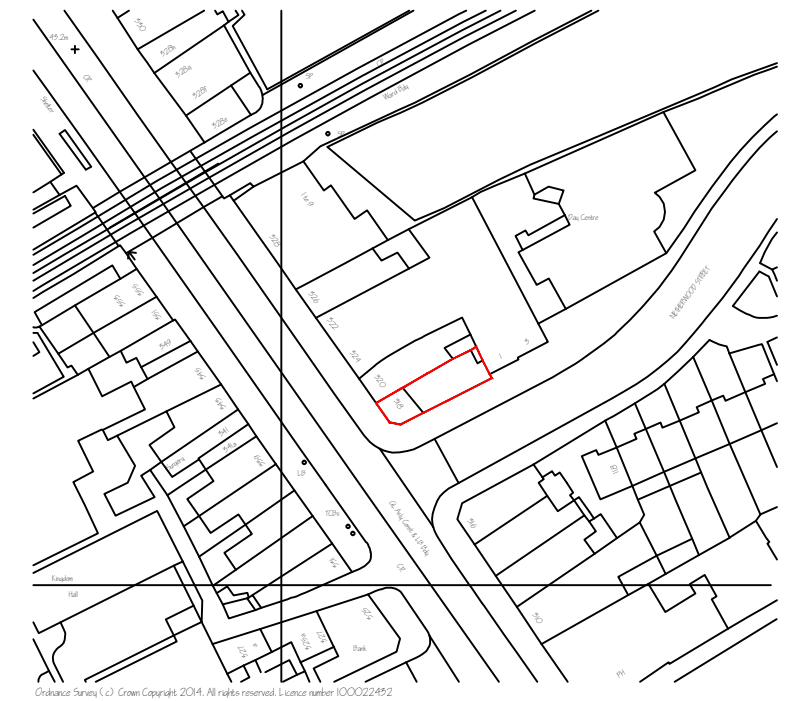
LOCATION PLAN ~ 1:1250