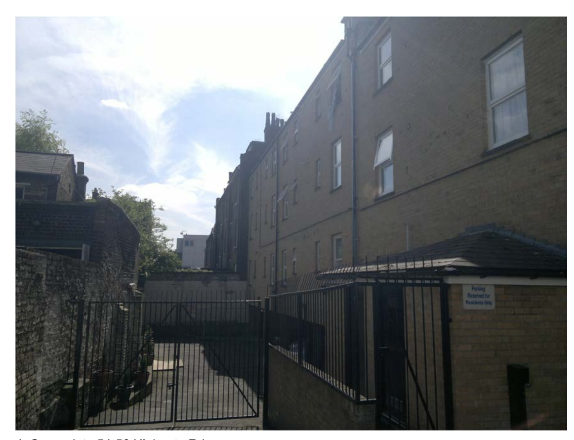
4. Car park to 54-56 Highgate Rd