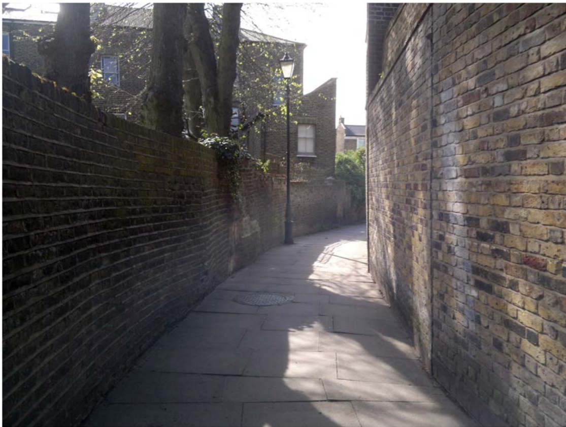
9. College Lane looking eastwards from No.8