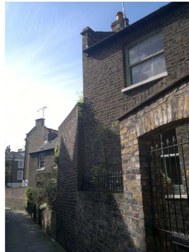
10. No. 3 College Lane