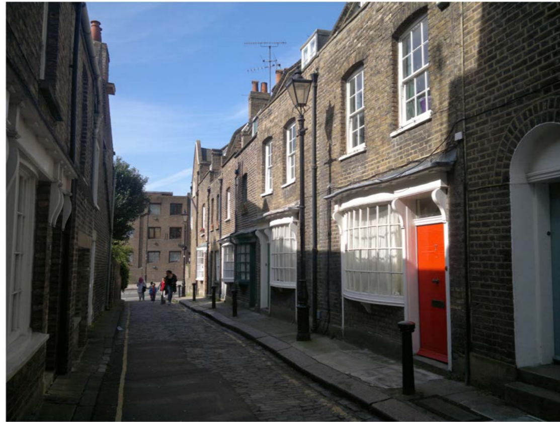
8. Little Green Street between College Lane and Highgate Road