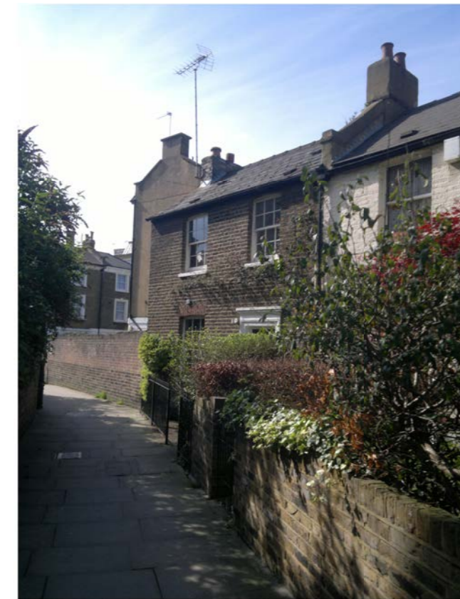
11. No. 1 & 2 College Lane