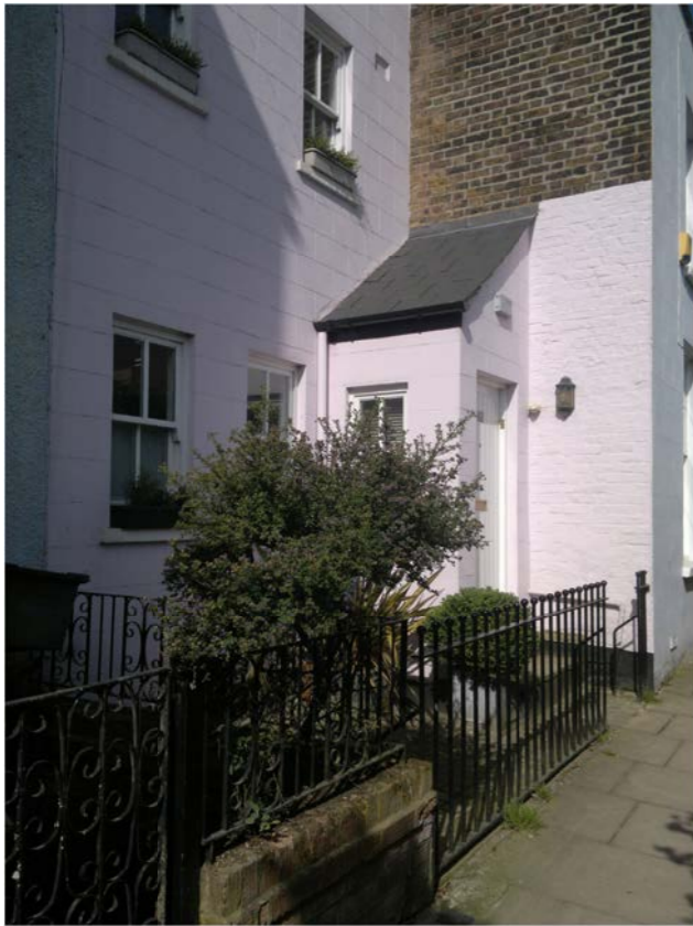
7. No 17 College Lane set back