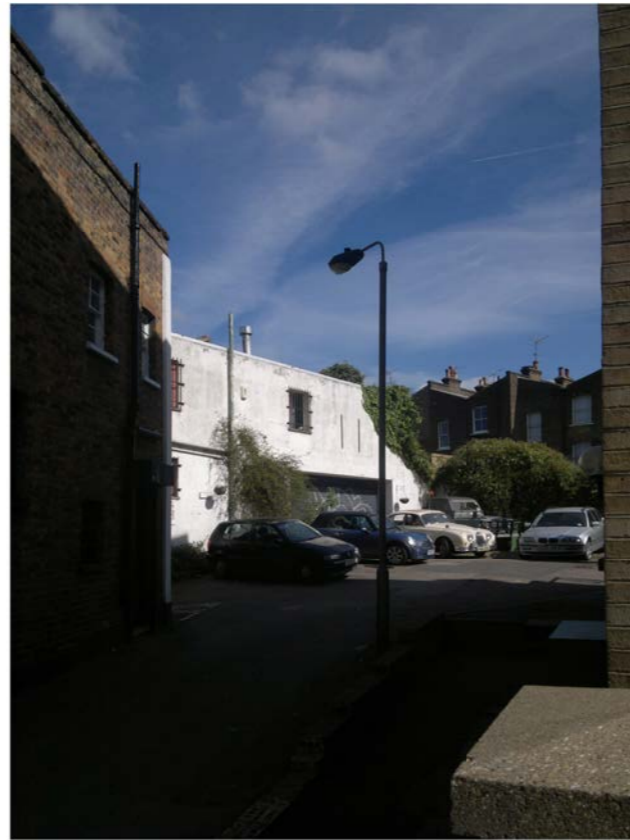
2. College Yard