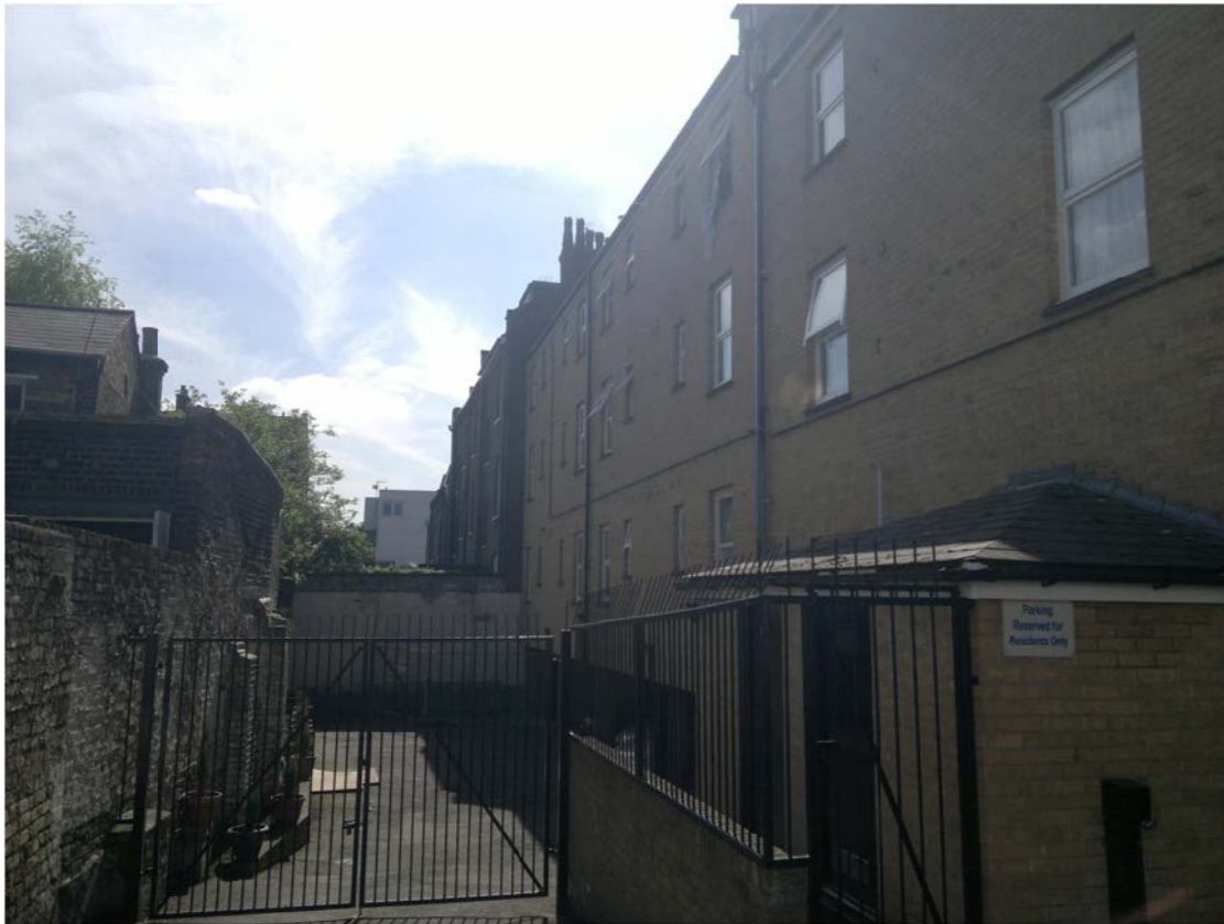
4. Car park to 54-56 Highgate Rd