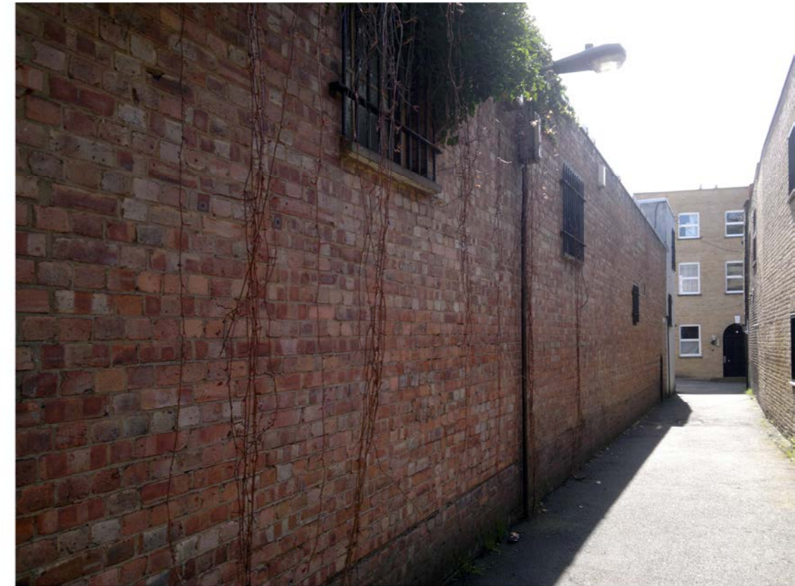
6. College Lane eastwards adjacent to site (on left)