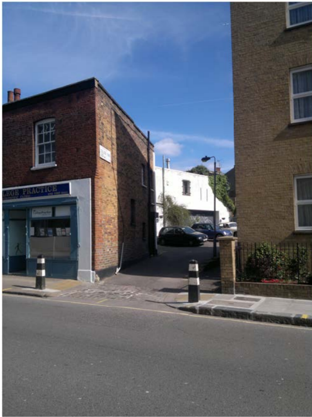
1. View from Highgate Rd.