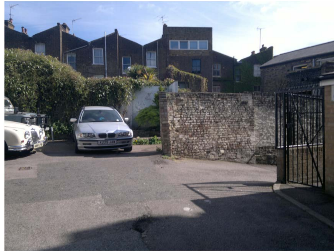
3. Other entrances onto College Yard