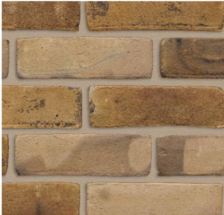
Ibstock Funton Old Chelsea Brick