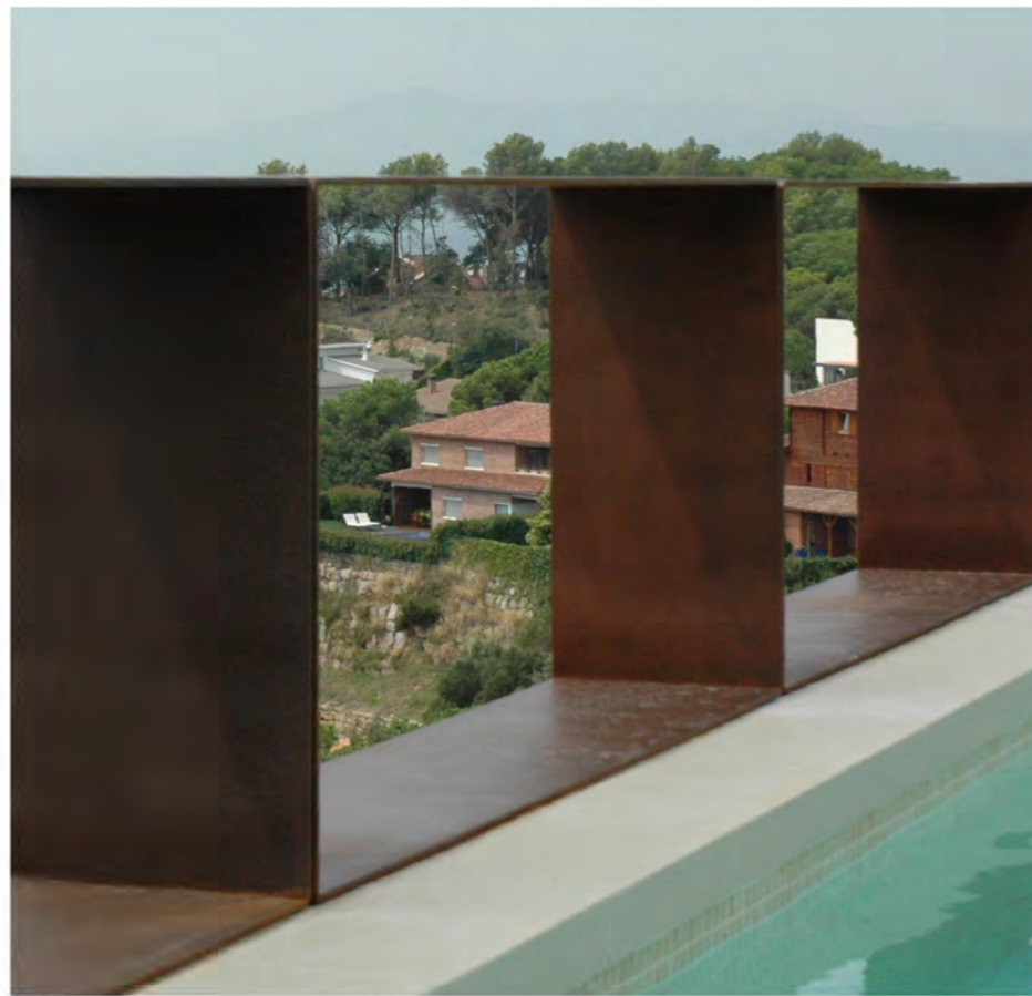
Cor-Ten Weathered Steel for Entrance Canopies