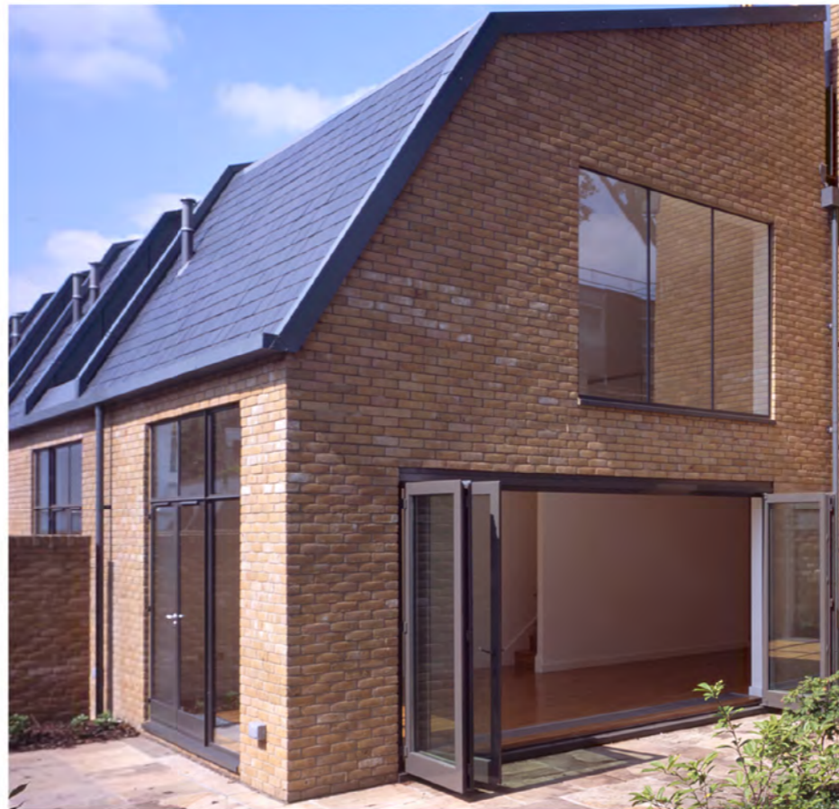
Slate Roofing With Metal Flashing