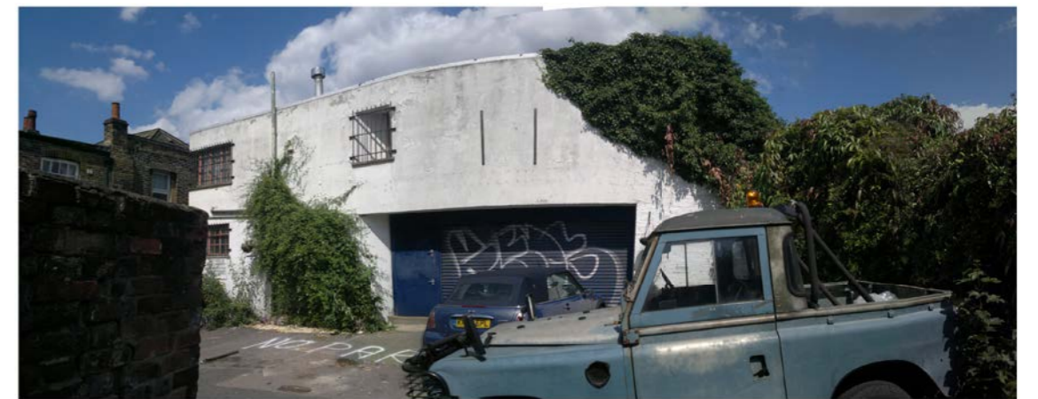
1b. Existing photo of College Yard from boundary with 1A College Yard