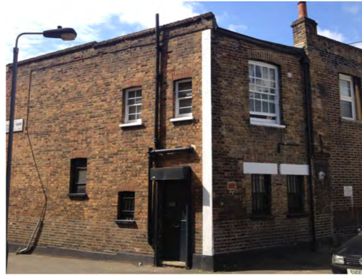
NO 60 HIGHGATE ROAD