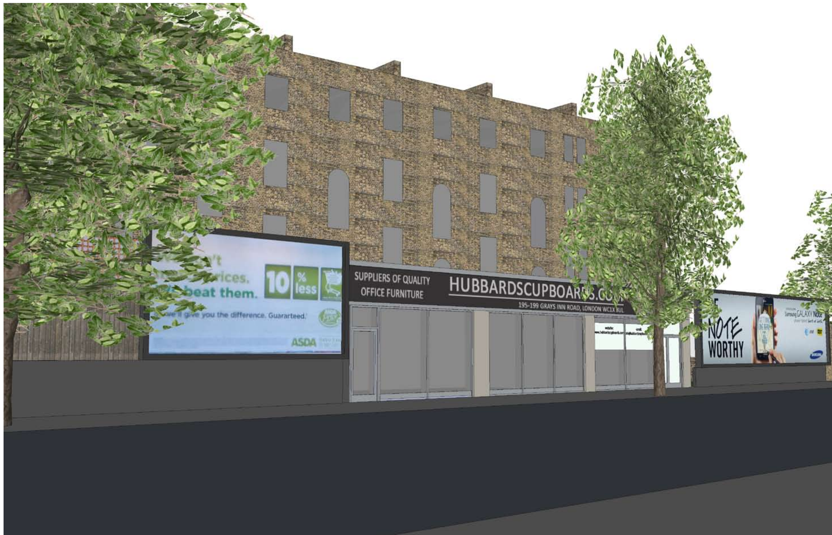
1155R 195-199 GRAYS INN ROAD LONDON WC1 EXISTING VIEW 2