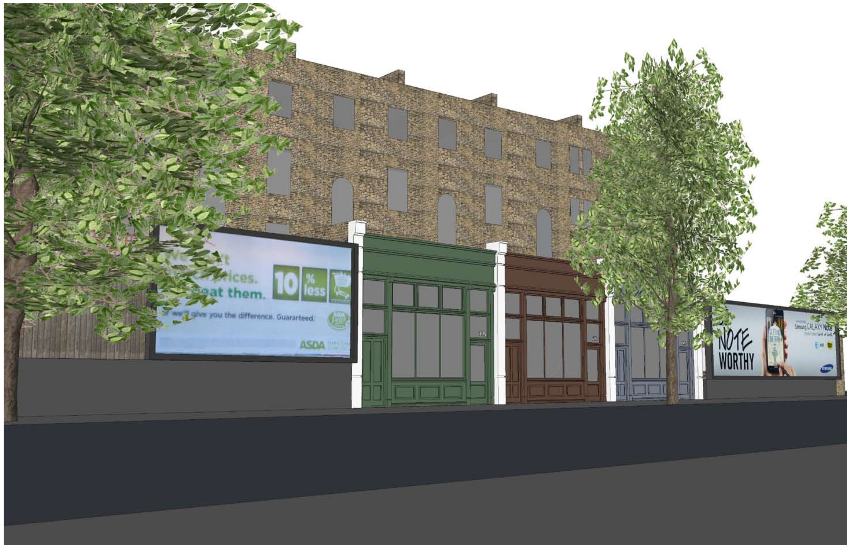
1155R 195-199 GRAYS INN ROAD LONDON WC1 PROPOSED VIEW 2