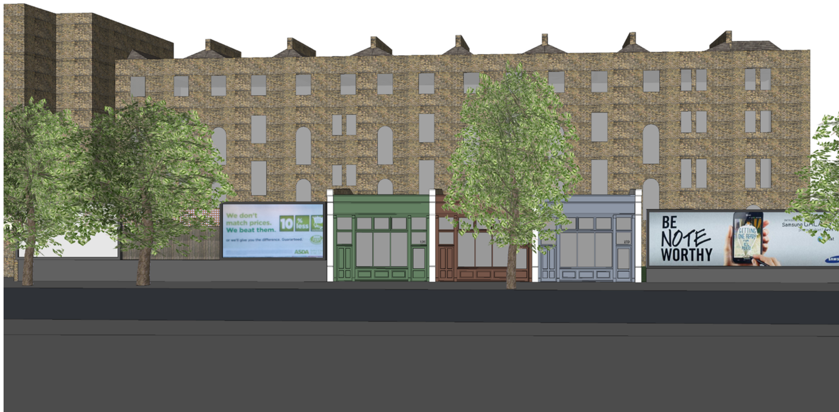
1155R 195-199 GRAYS INN ROAD LONDON WC1 PROPOSED VIEW 3