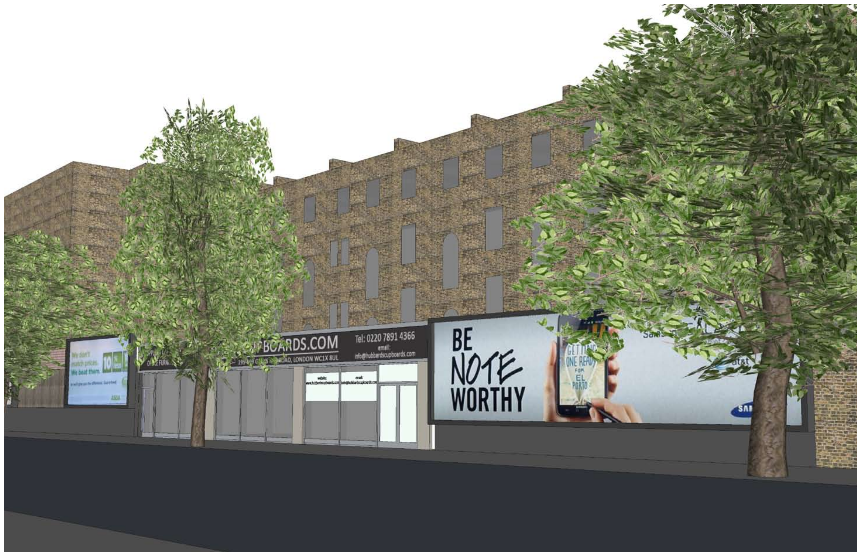
1155R 195-199 GRAYS INN ROAD LONDON WC1 EXISTING VIEW 1