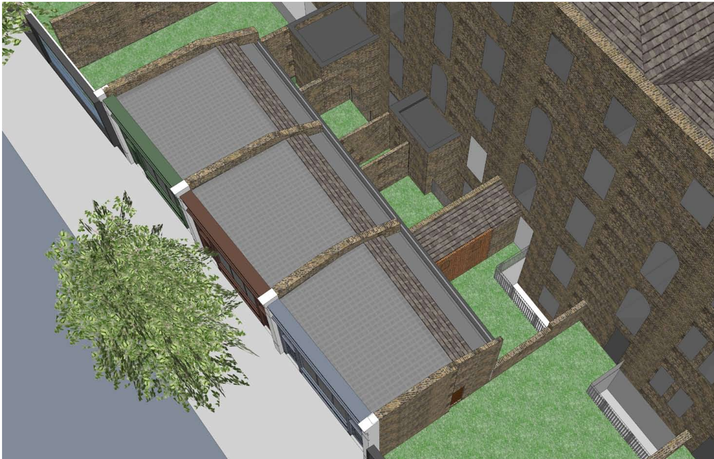
1155R 195-199 GRAYS INN ROAD LONDON WC1 PROPOSED AERIAL VIEW