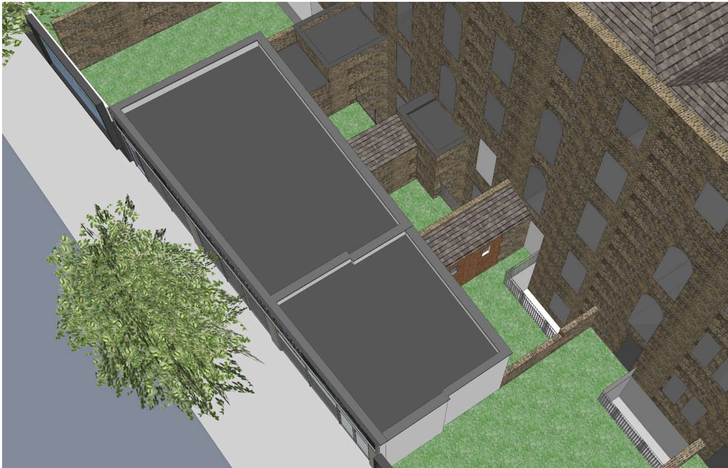
1155R 195-199 GRAYS INN ROAD LONDON WC1 EXISTING AERIAL VIEW