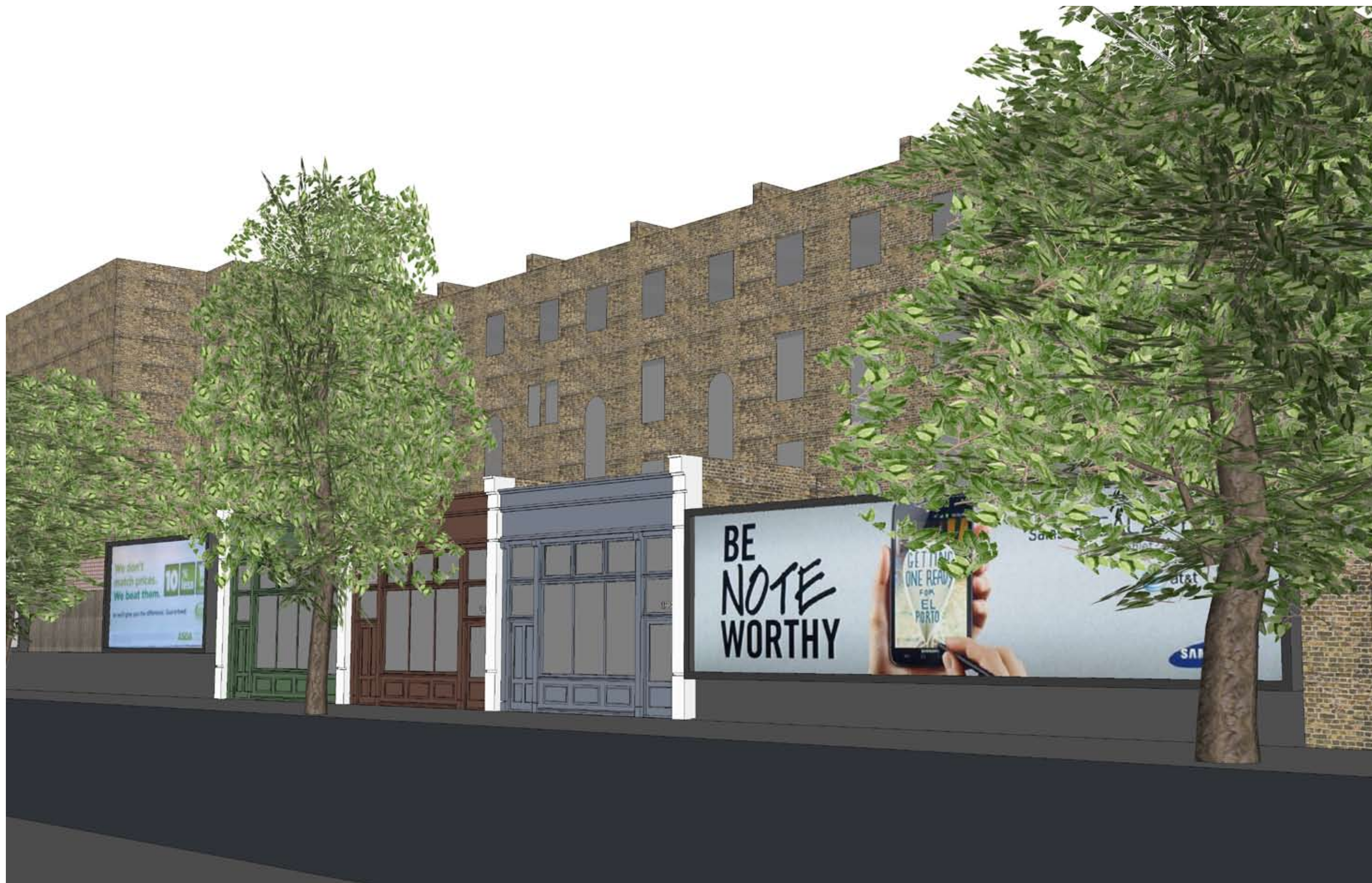
1155R 195-199 GRAYS INN ROAD LONDON WC1 PROPOSED VIEW 1