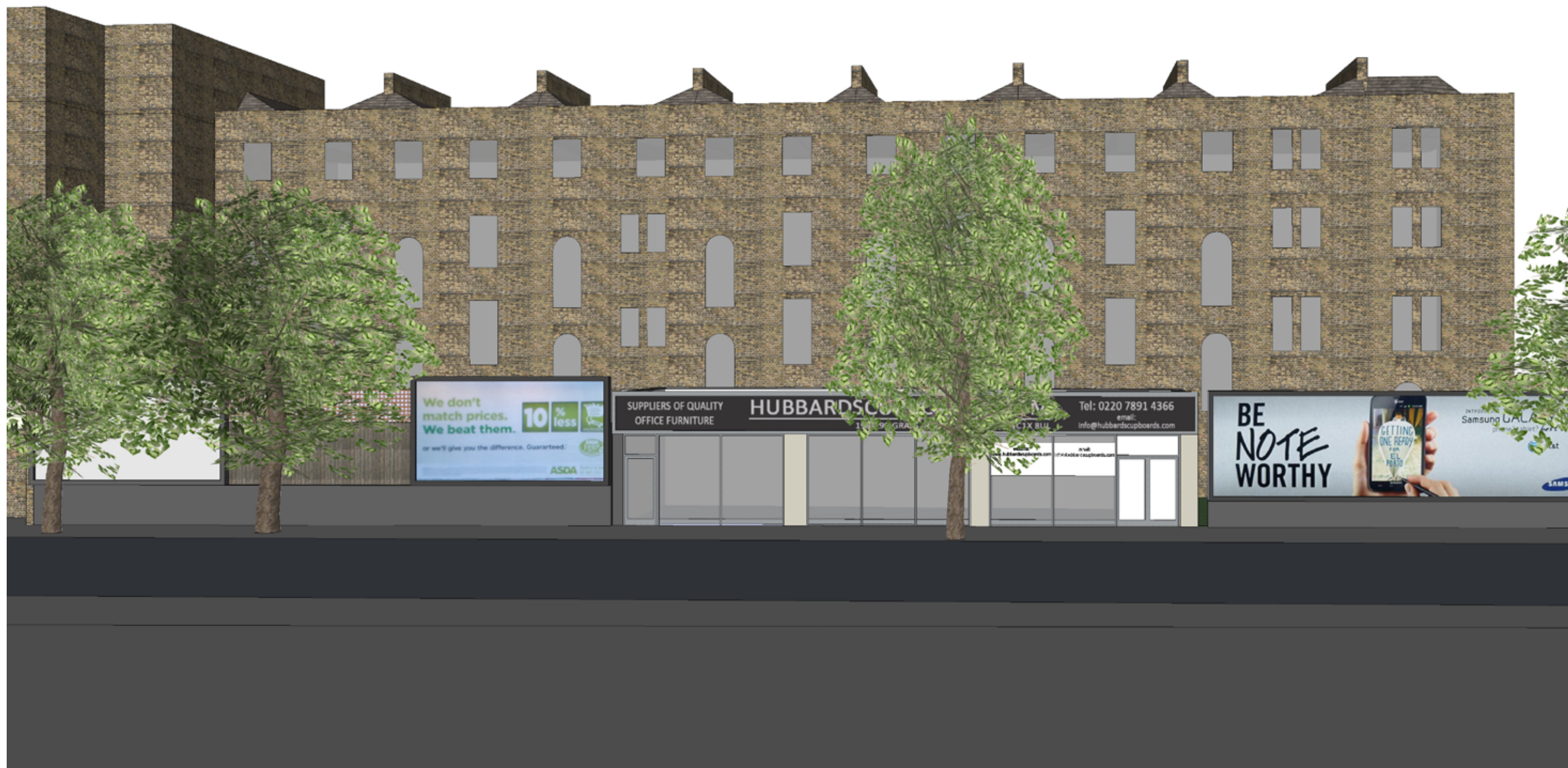
1155R 195-199 GRAYS INN ROAD LONDON WC1 EXISTING VIEW 3