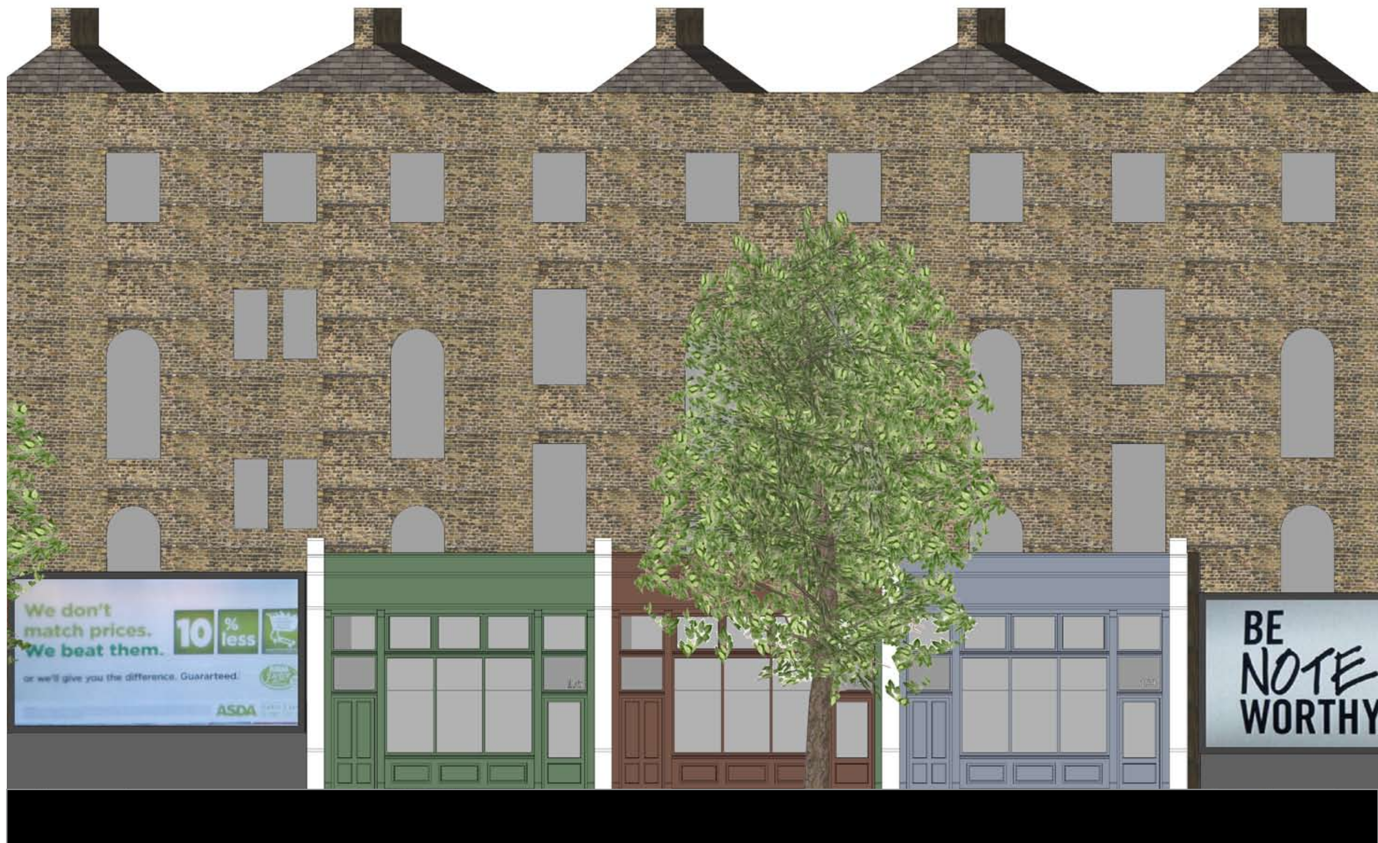
1155R 195-199 GRAYS INN ROAD LONDON WC1 PROPOSED FRONT ELEVATION