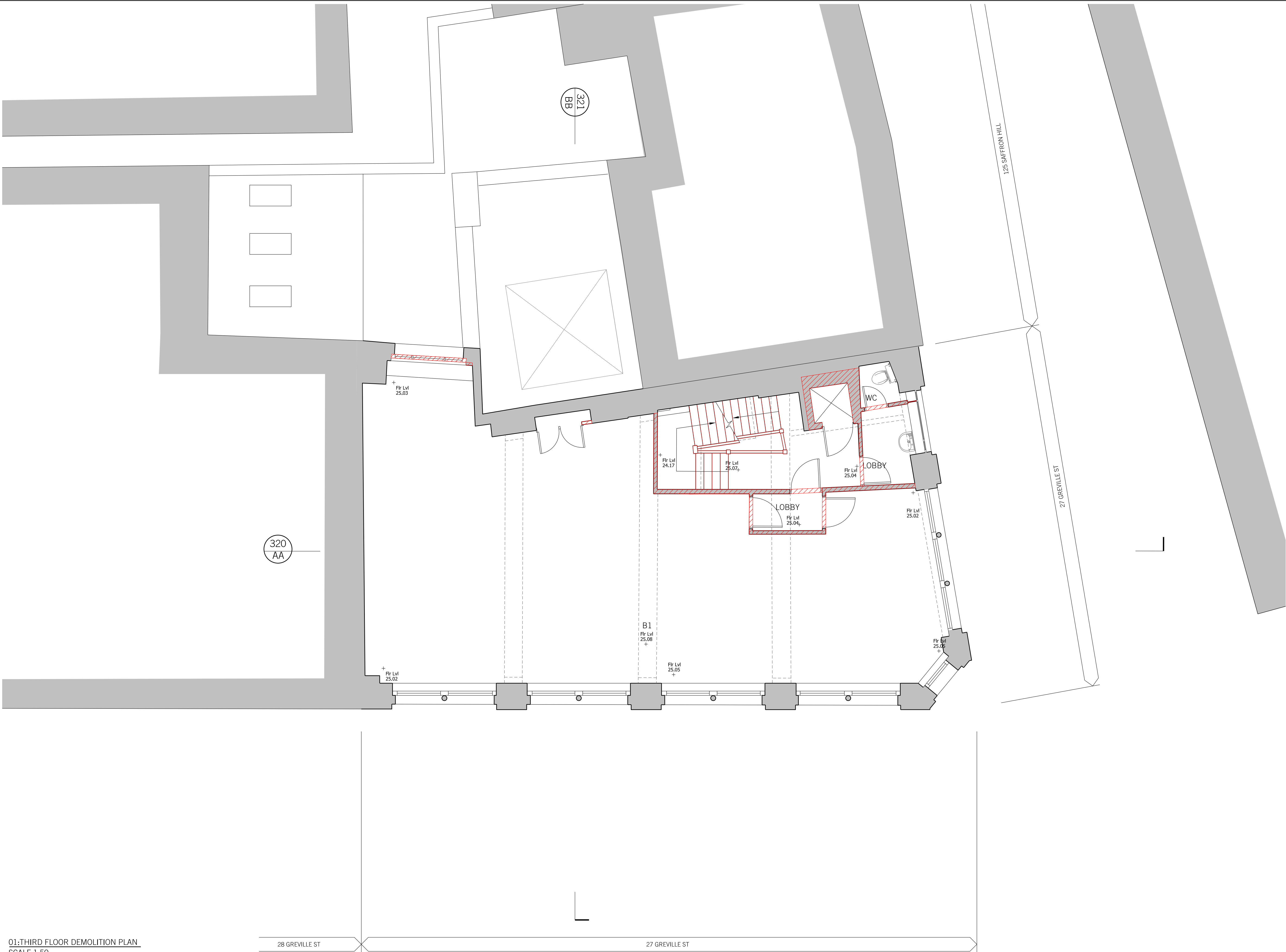
Q1:THIRD FLOOR DEMOLITION PLAN SCALE 1:50