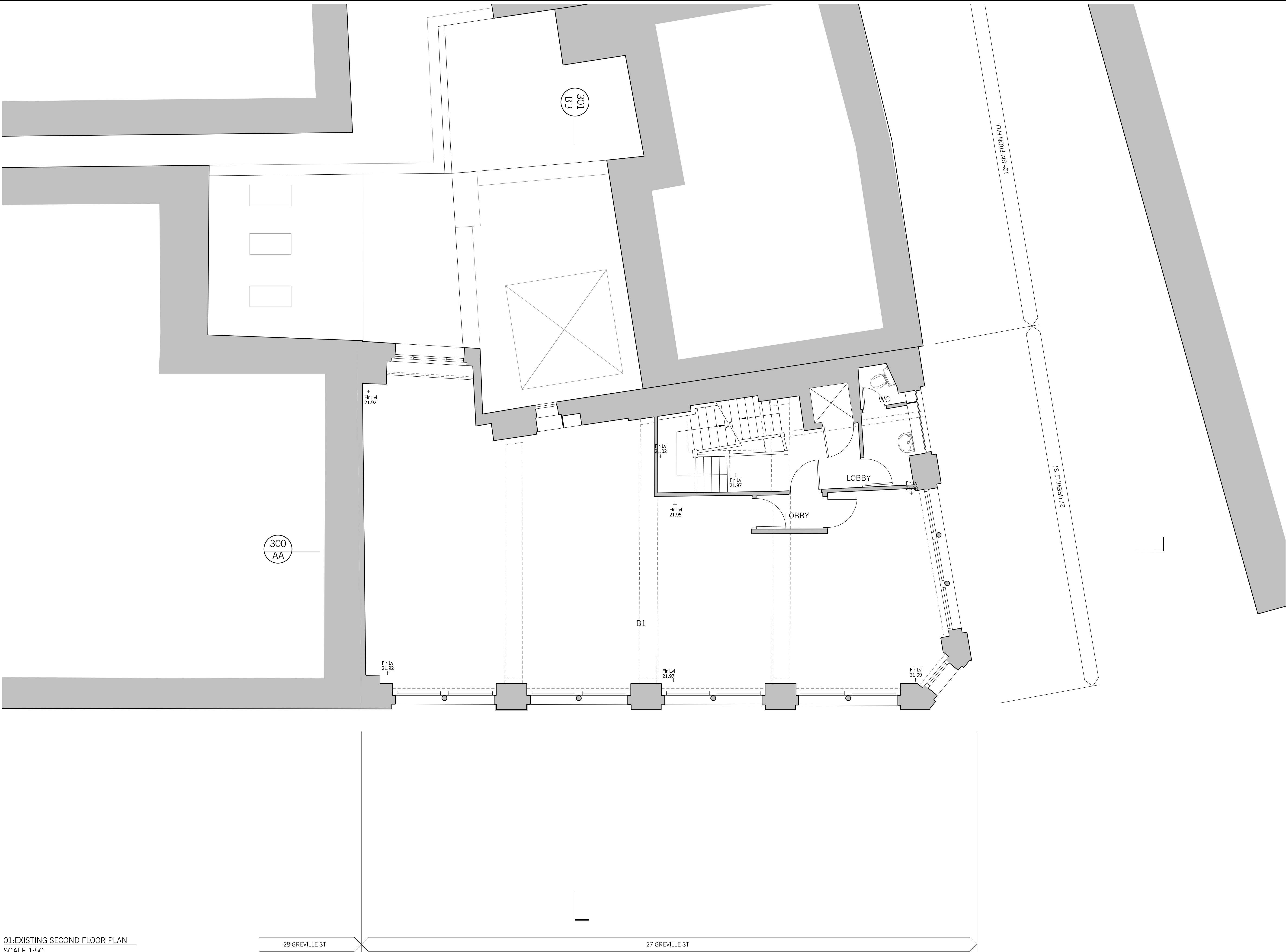
01:EXISTING SECOND FLOOR PLAN SCALE 1:50