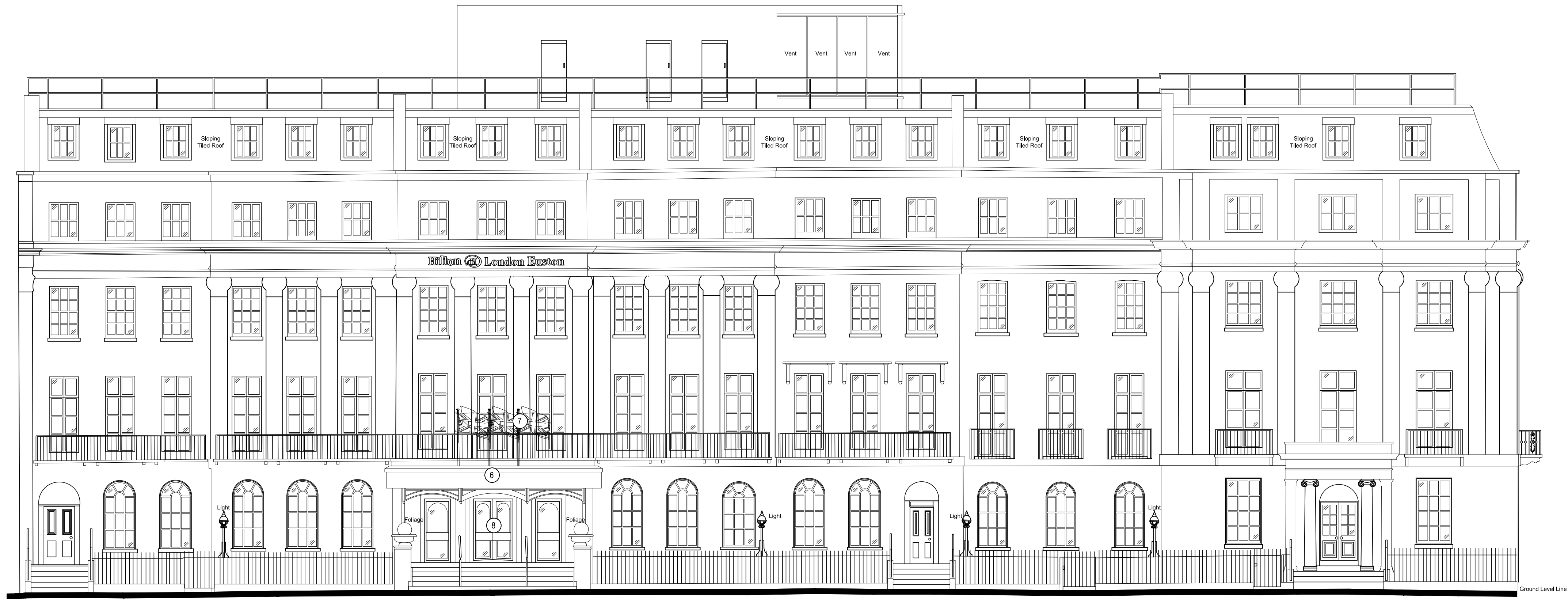
UPPER WOBURN PLACE ELEVATION : AS EXISTING