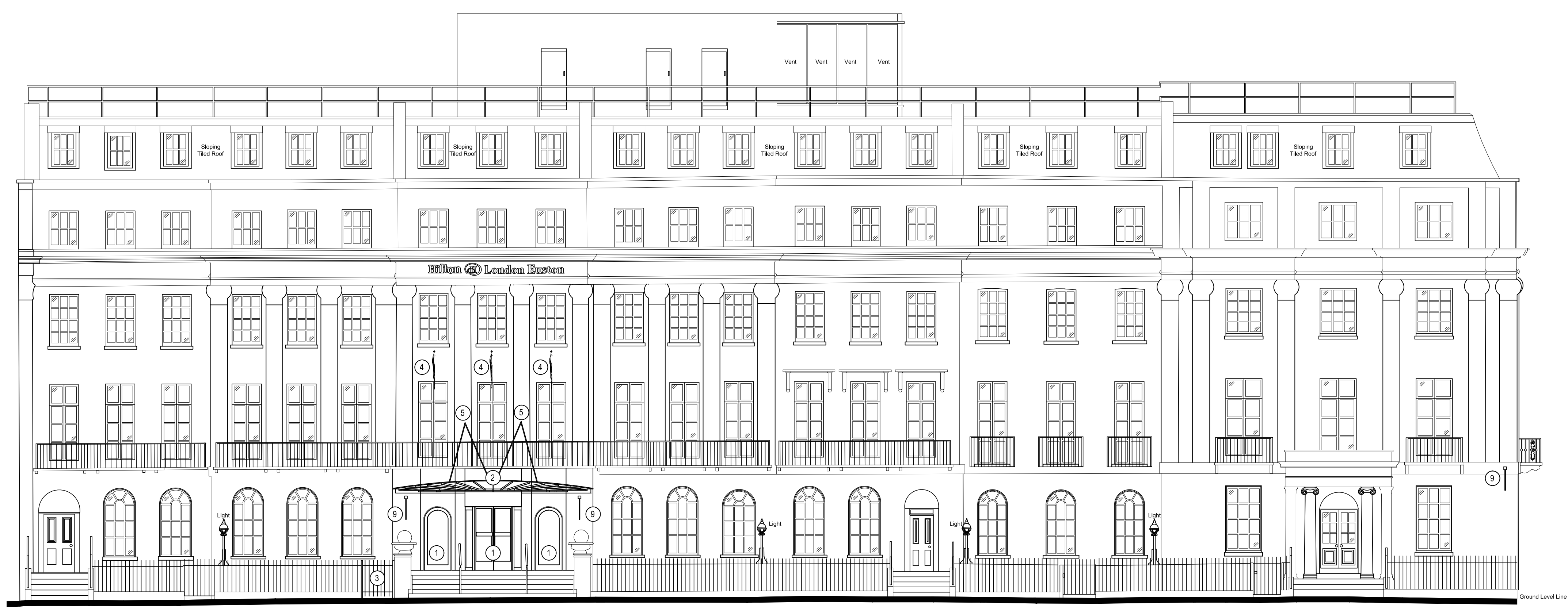
UPPER WOBURN PLACE ELEVATION : AS PROPOSED