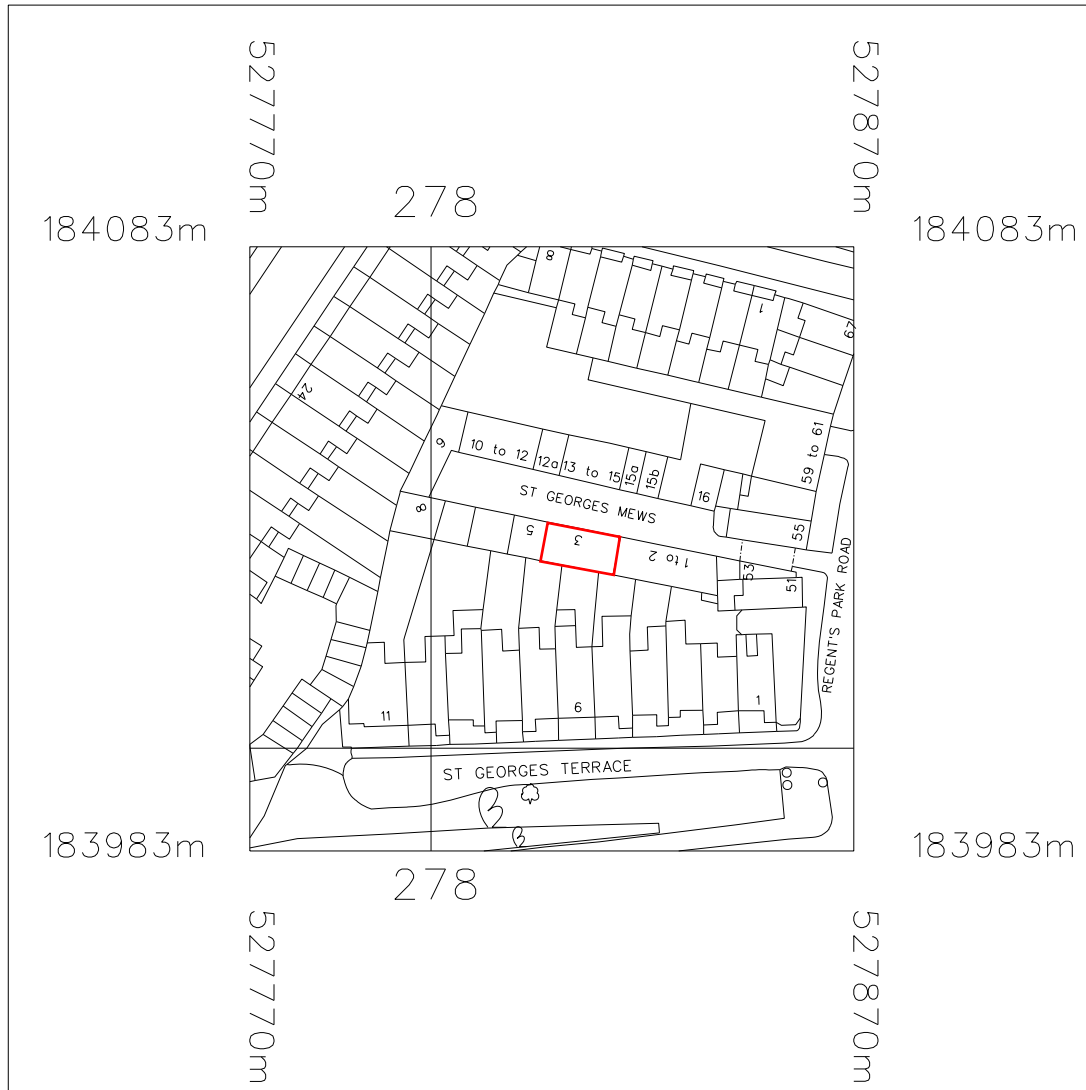
SITE LOCATION PLAN AT 1:1250 AT A4 Application site edged with red line