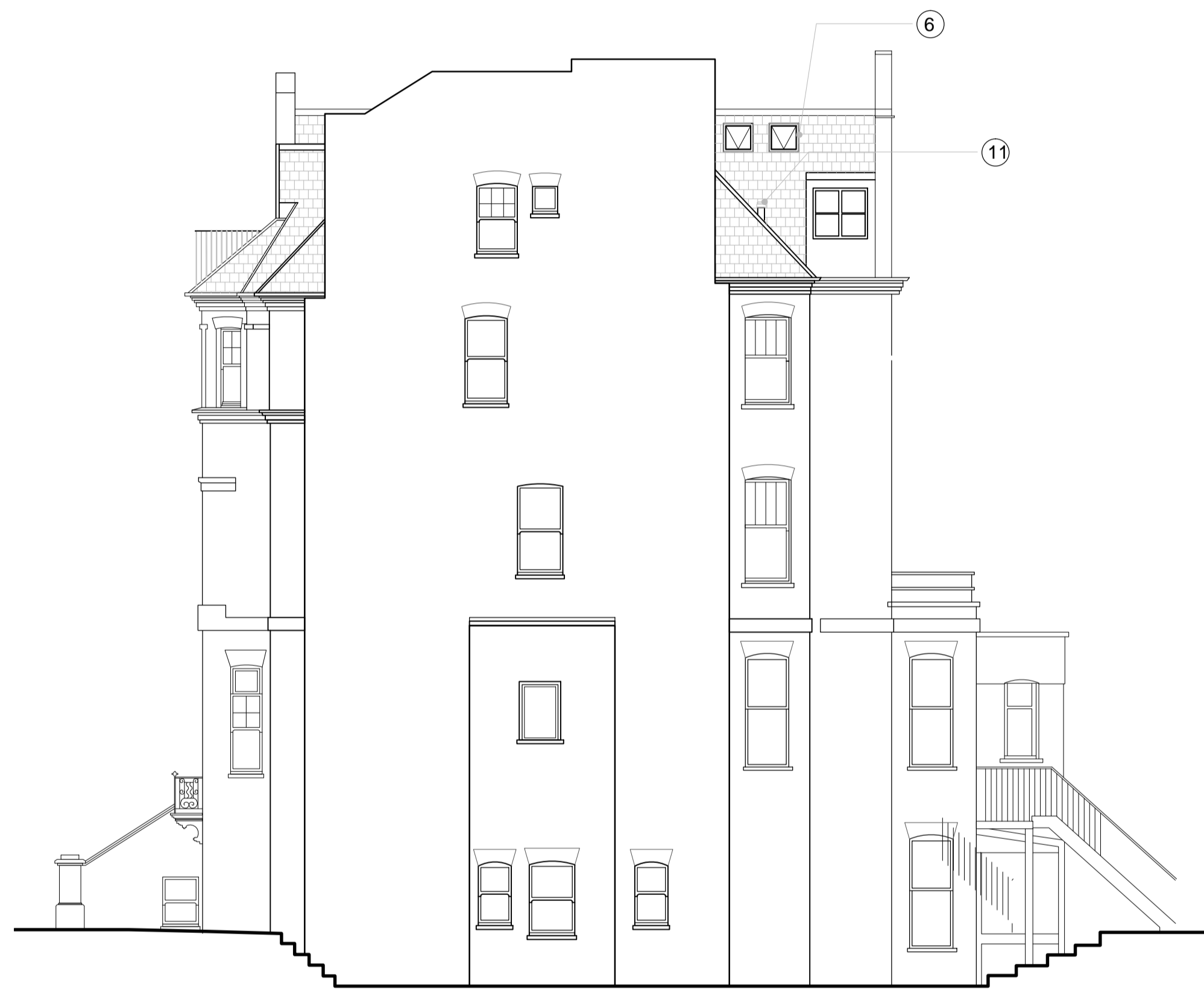
1 SIDE ELEVATION (EAST) Scale: 1:100 A1