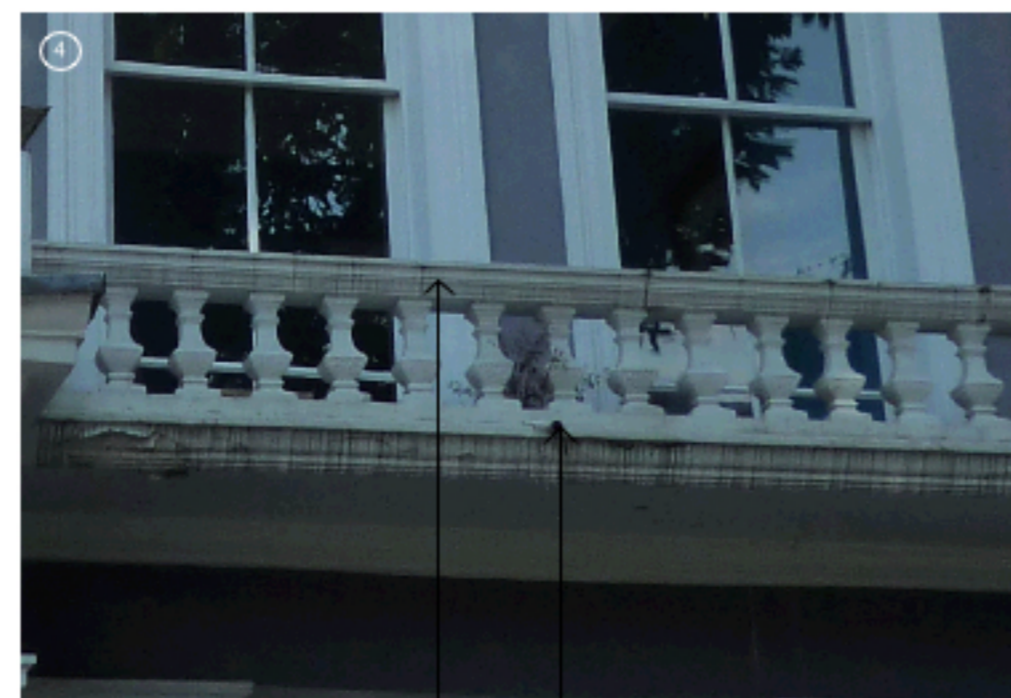
restoration of first floor balcony