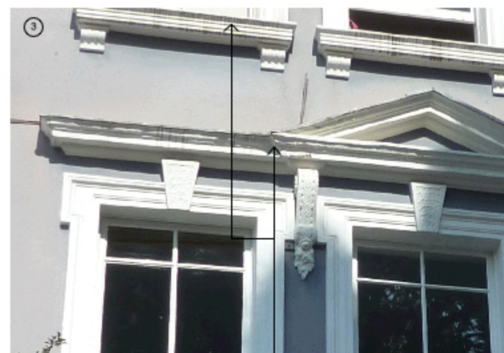
window moldings and capitals to be repaired