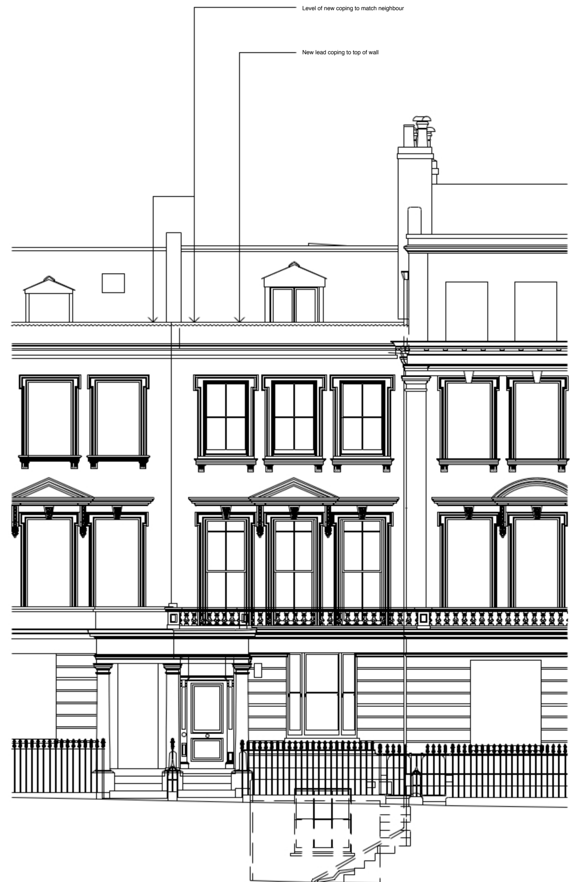
STREET ELEVATION AS PROPOSED