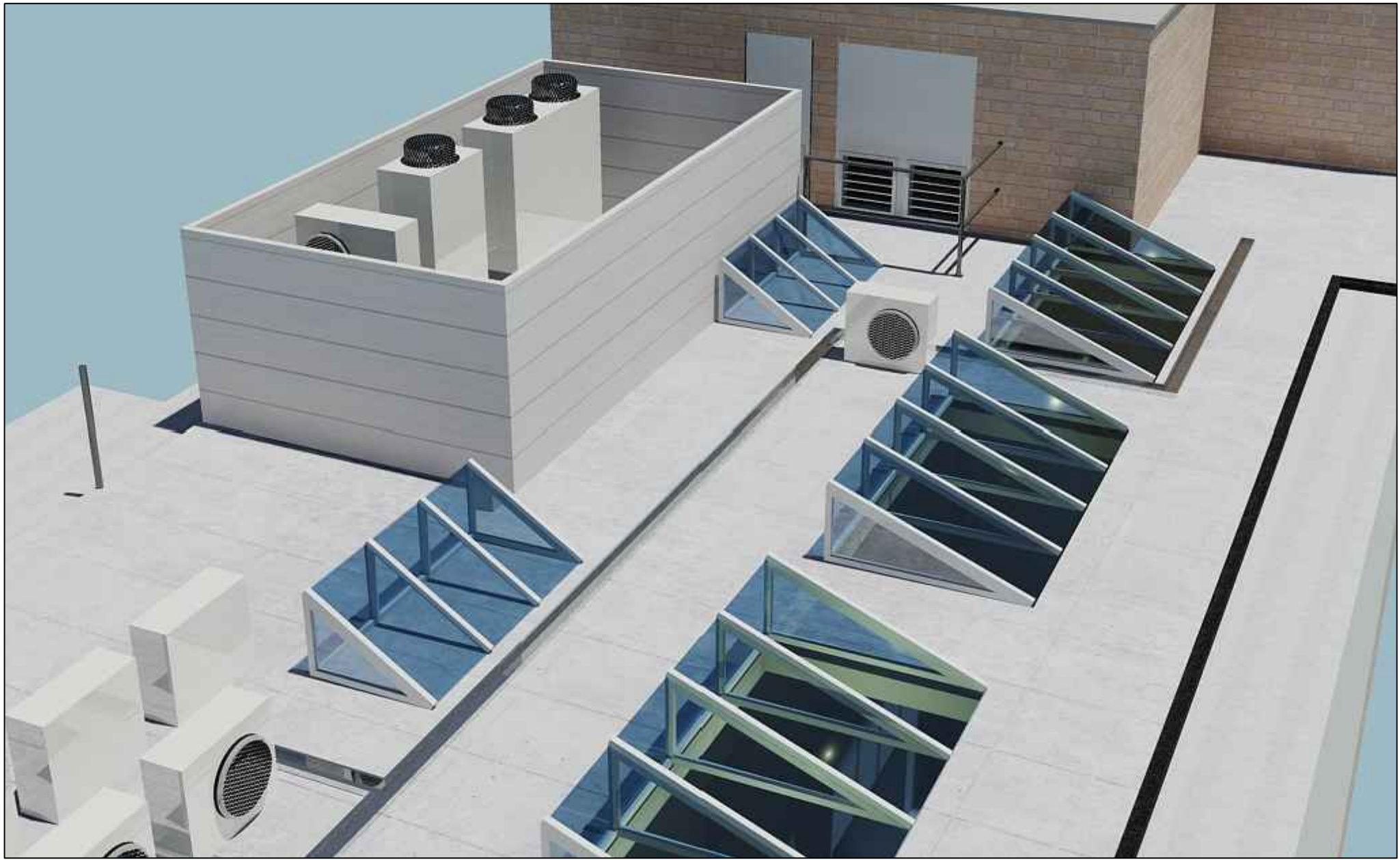
PROPOSED A/C COMPOUND - CONCEPTUAL VIEW (NTS)