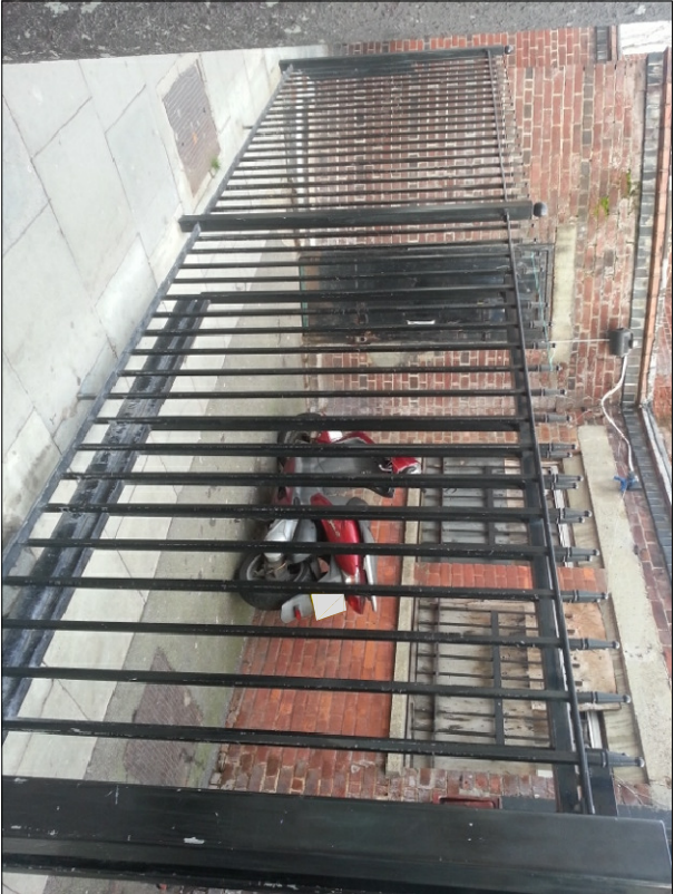
Reference picture showing proposed gate design