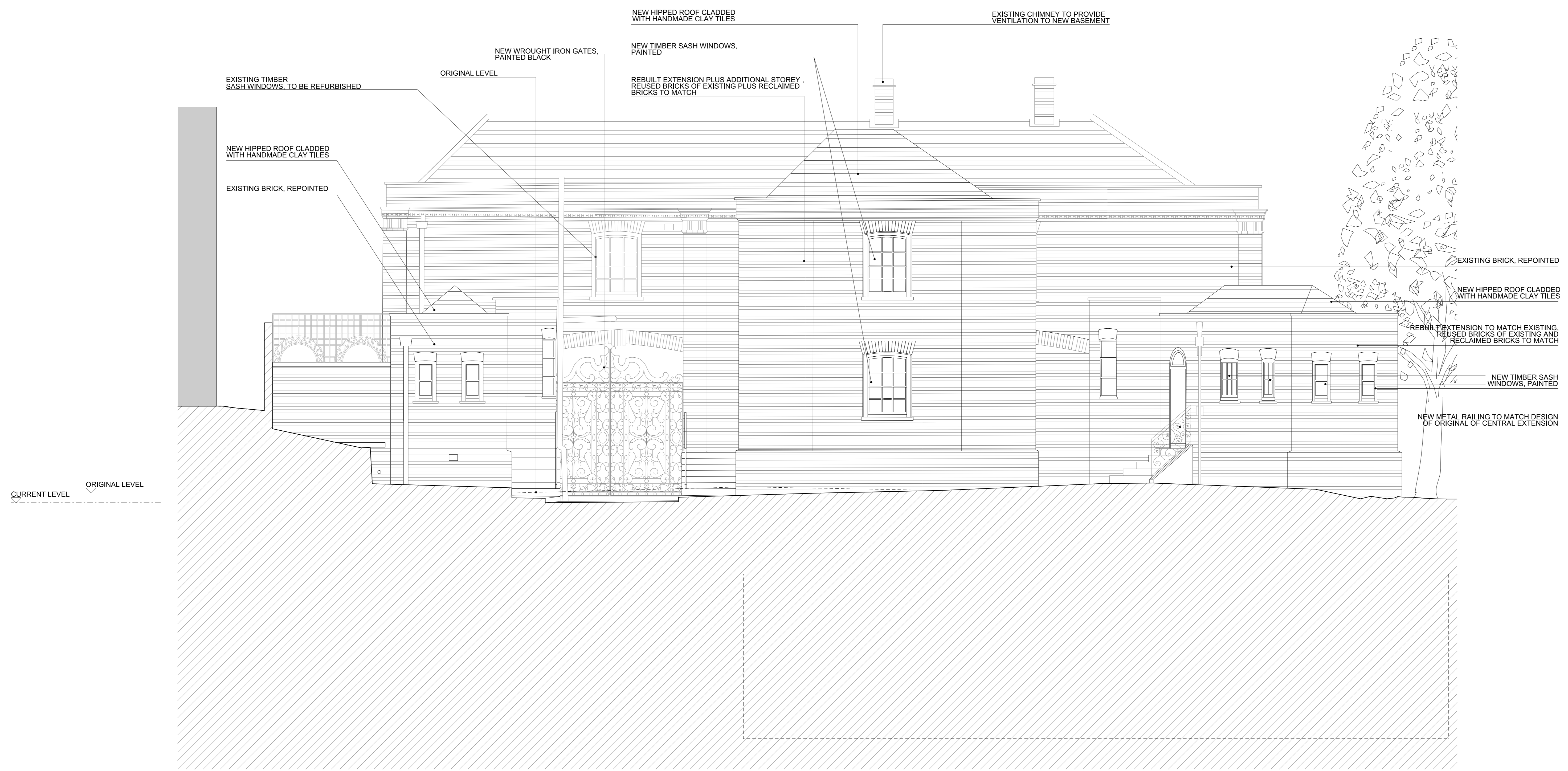
11 REAR ELEVATION 1:50 @ A0