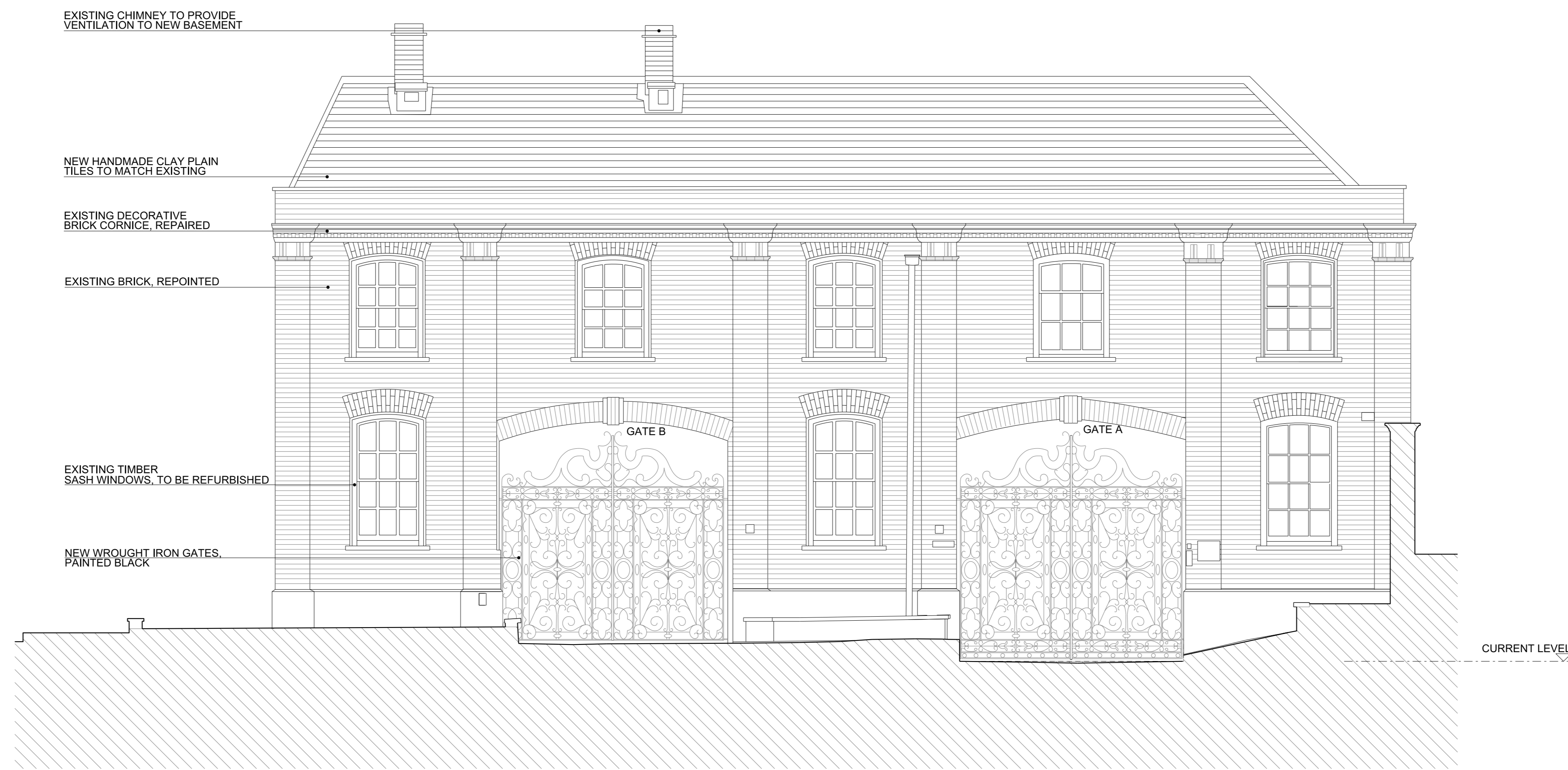
10 FRONT ELEVATION 1:50 @ A0