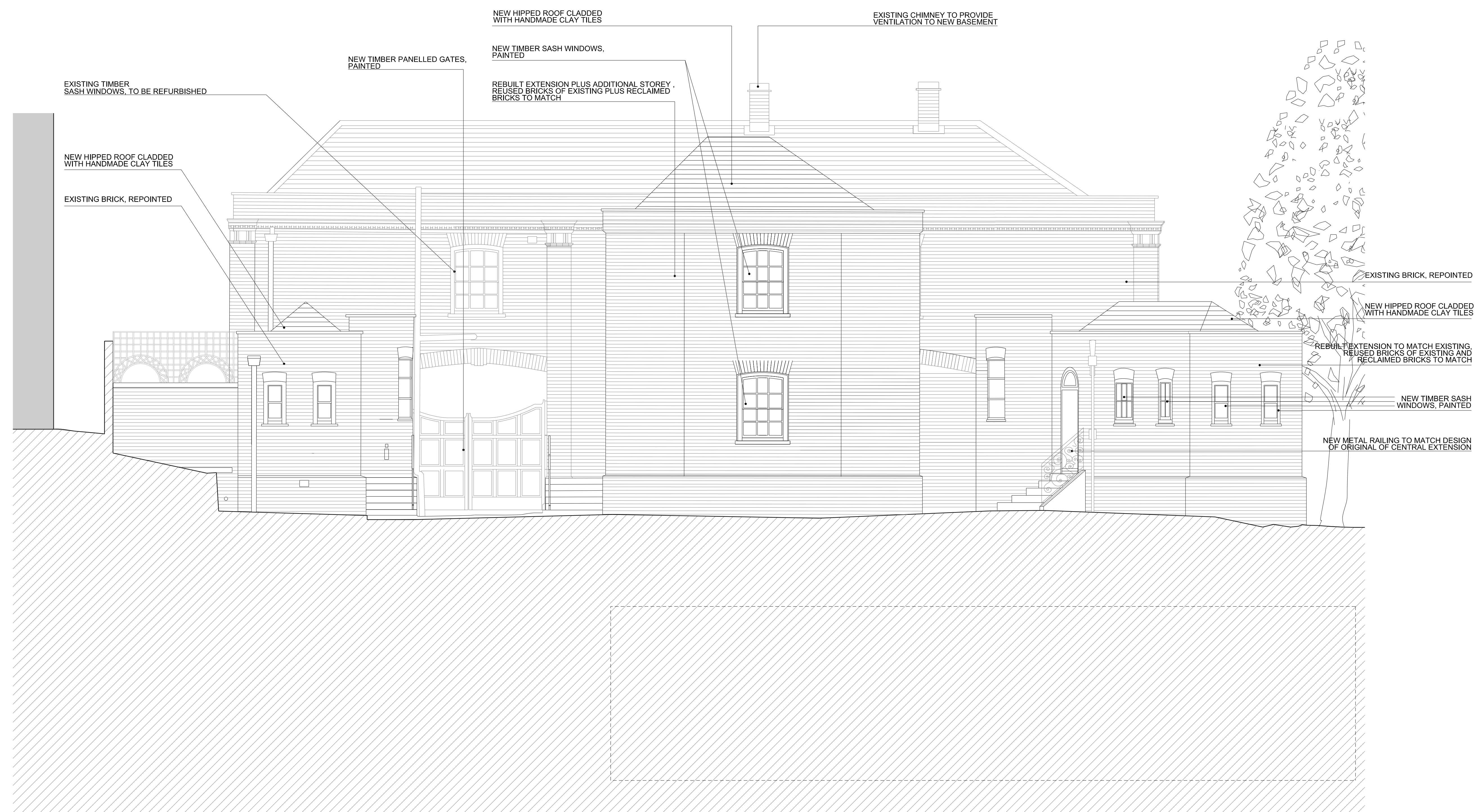
11 REAR ELEVATION 1:50 @ A0