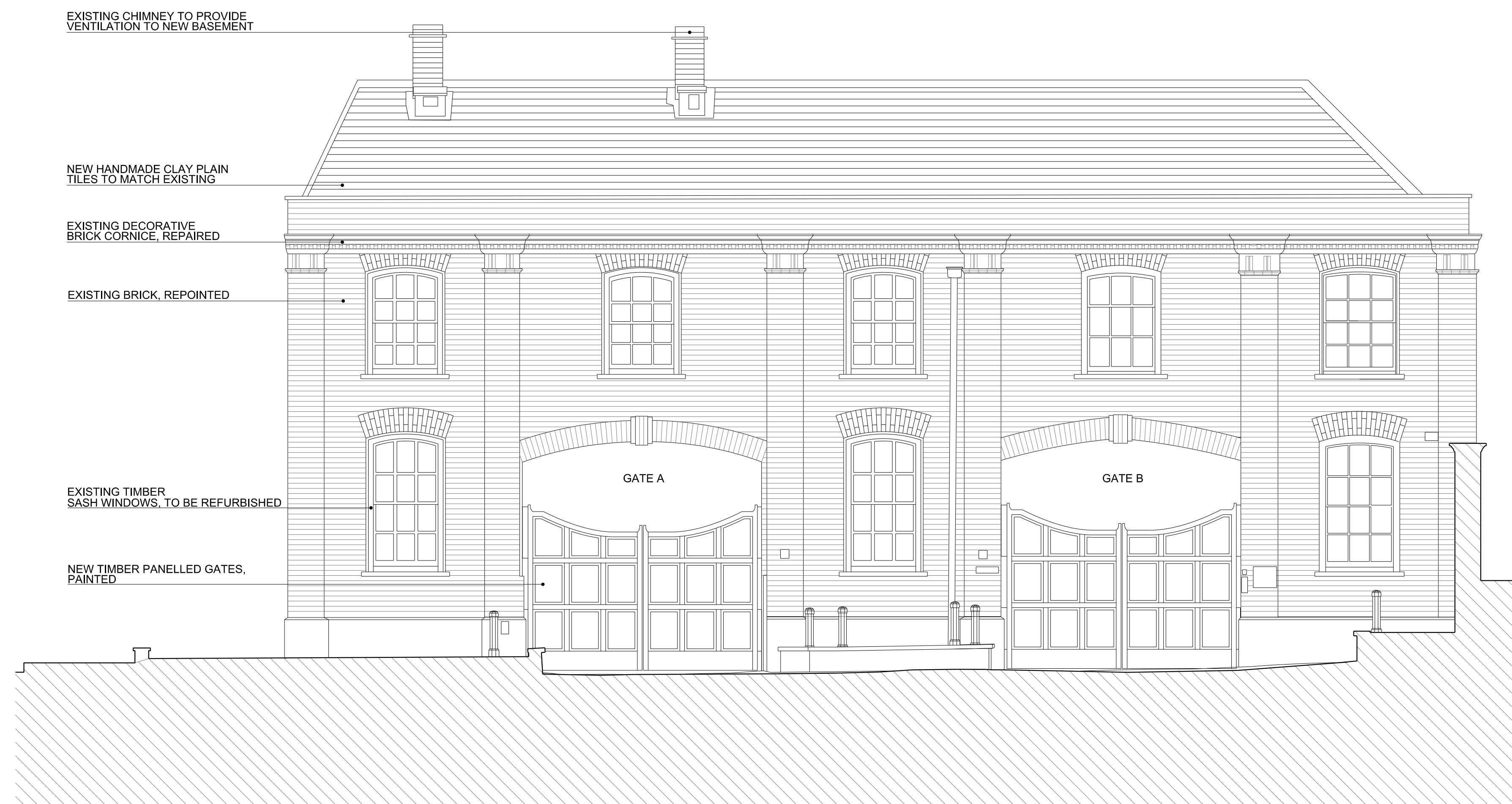
10 FRONT ELEVATION 1:50 @ A0