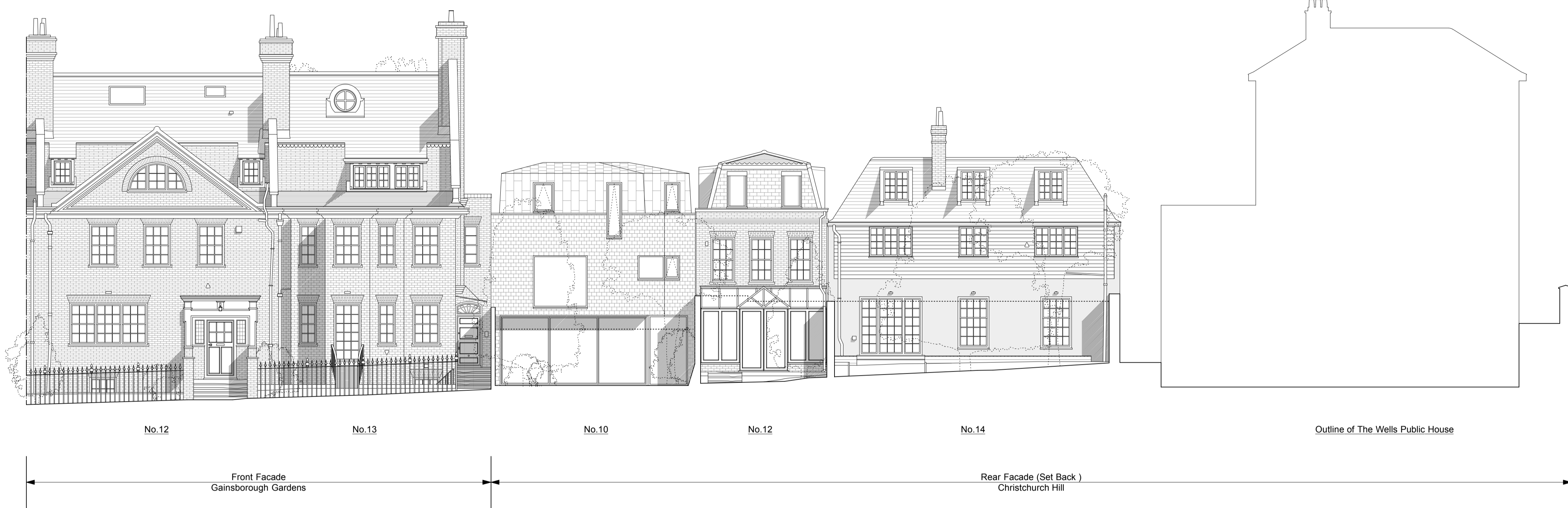
Proposed Rear Elevation & Section Through Rear Gardens Of Christchurch Hill & Front Elevation Of Gainsborough Gardens (D)