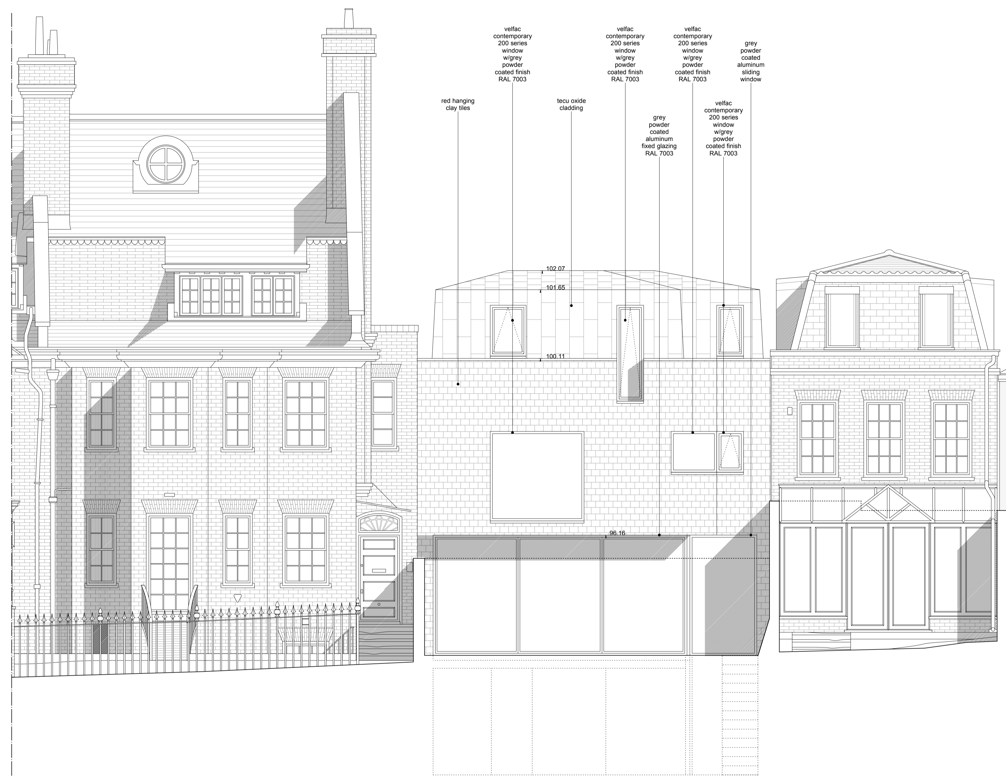
Front Facade of No. 13 Gainsborough Gardens

NOTES: For elevation location information, please see drawing PL_G001