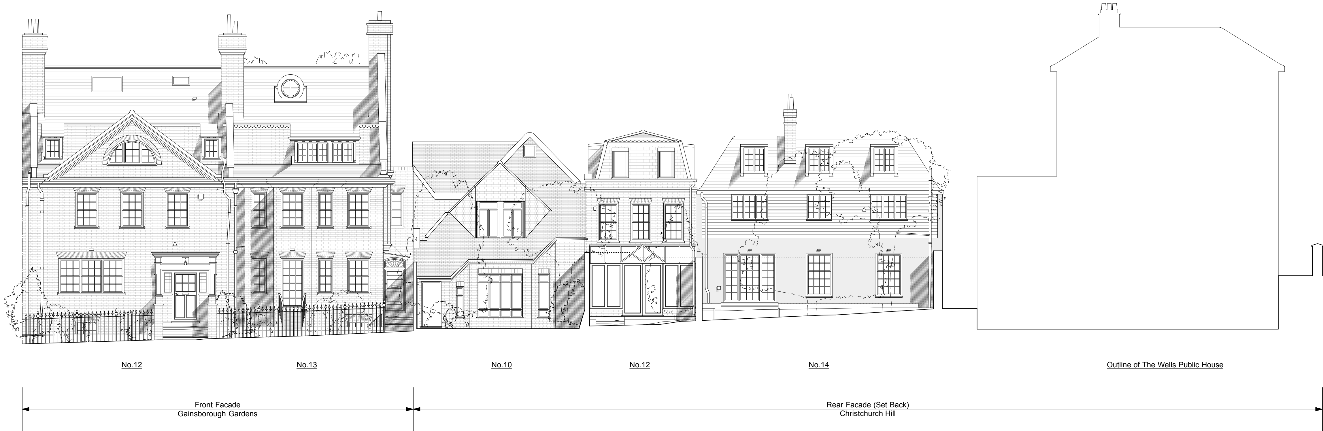
Existing Rear Elevation & Section Through Rear Gardens Of Christchurch Hill & Front Elevation Of Gainsborough Gardens (D)