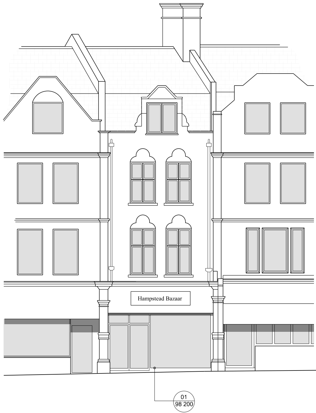
01 Existing Front Elevation 1:100@A3