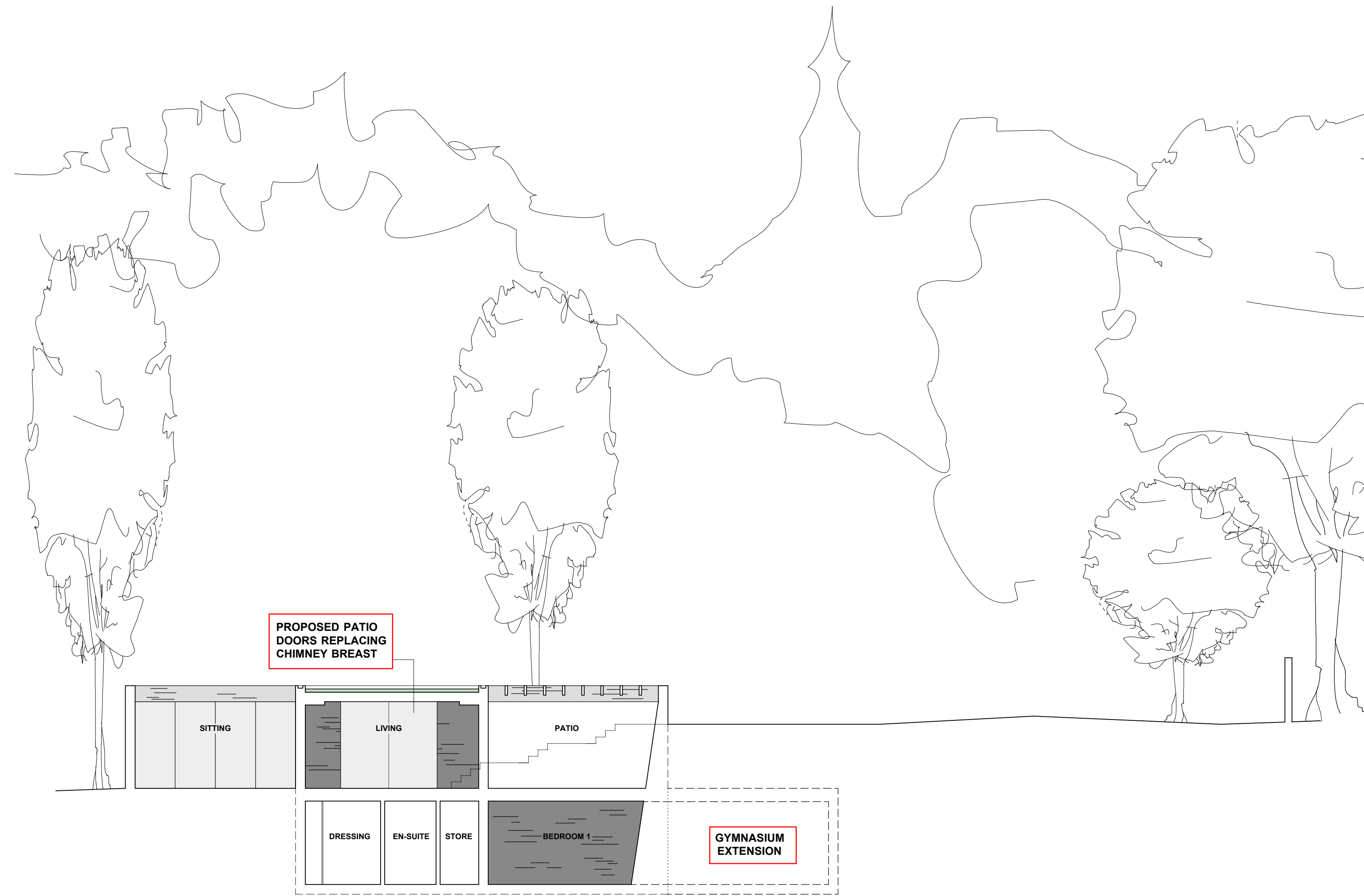
PROPOSED SECTION D 1:100 @ A1