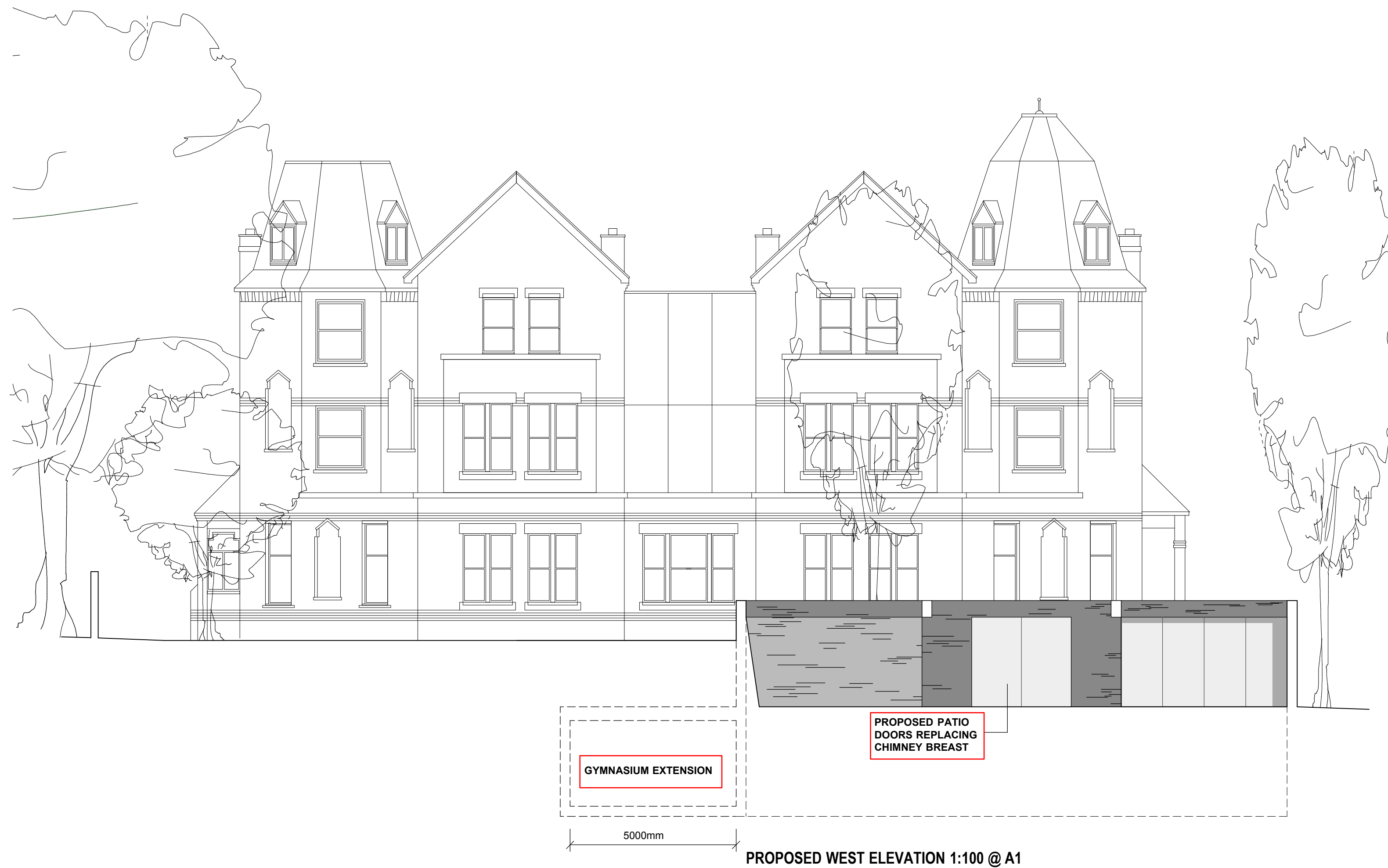
PROPOSED WEST ELEVATION 1:100 @ A1