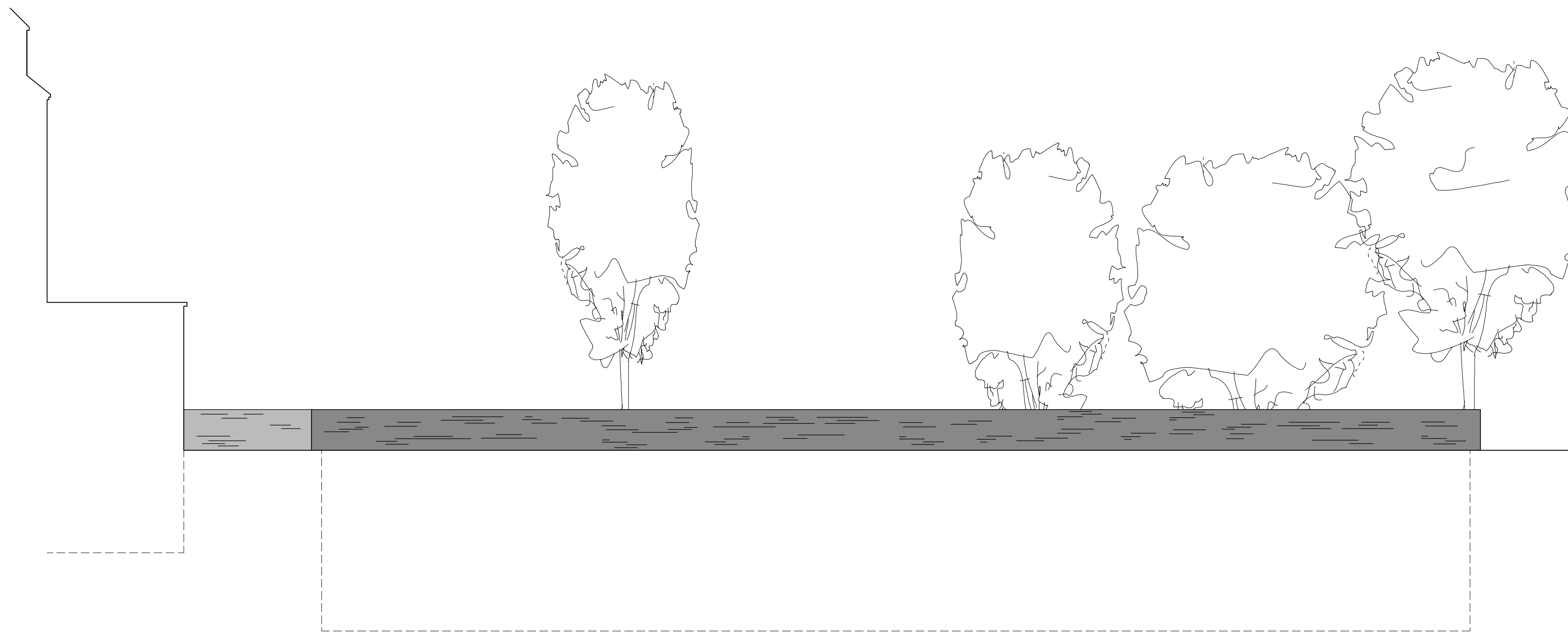
CONSENTED NORTH ELEVATION 1:100 @ A1