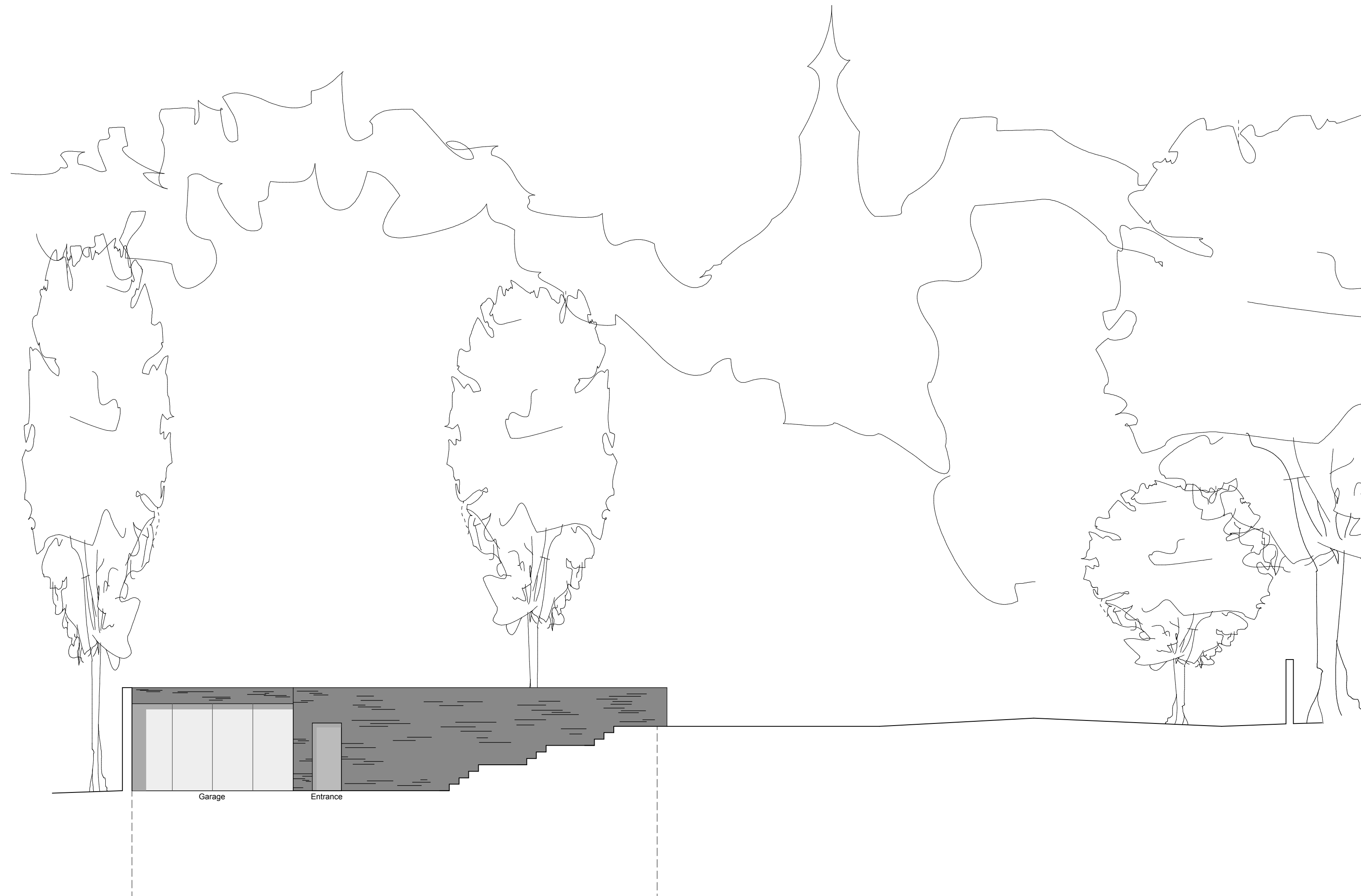
CONSENTED EAST ELEVATION 1:100 @ A1