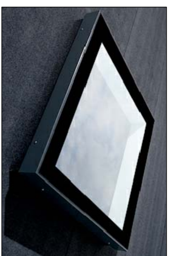
ROOFLIGHT. ALUMINIUM POWDER COATED