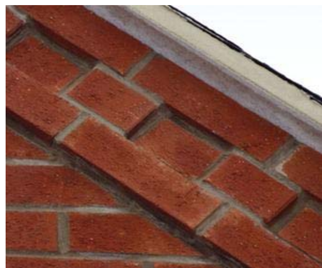
Decorative corbelled brick eaves with dentil course