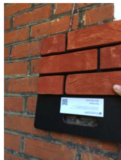
Charnwood Red Mixture Hand Made Brick (sample submitted) laid in stretcher bond with flush pointing (all to match main house). Mortar to be colour-matched on site to main house.