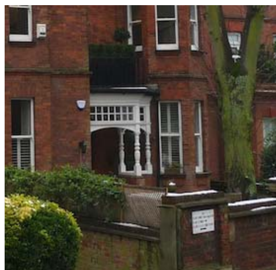
White painted timber mouldings to projecting bay with lead roof matching main house entrance canopy