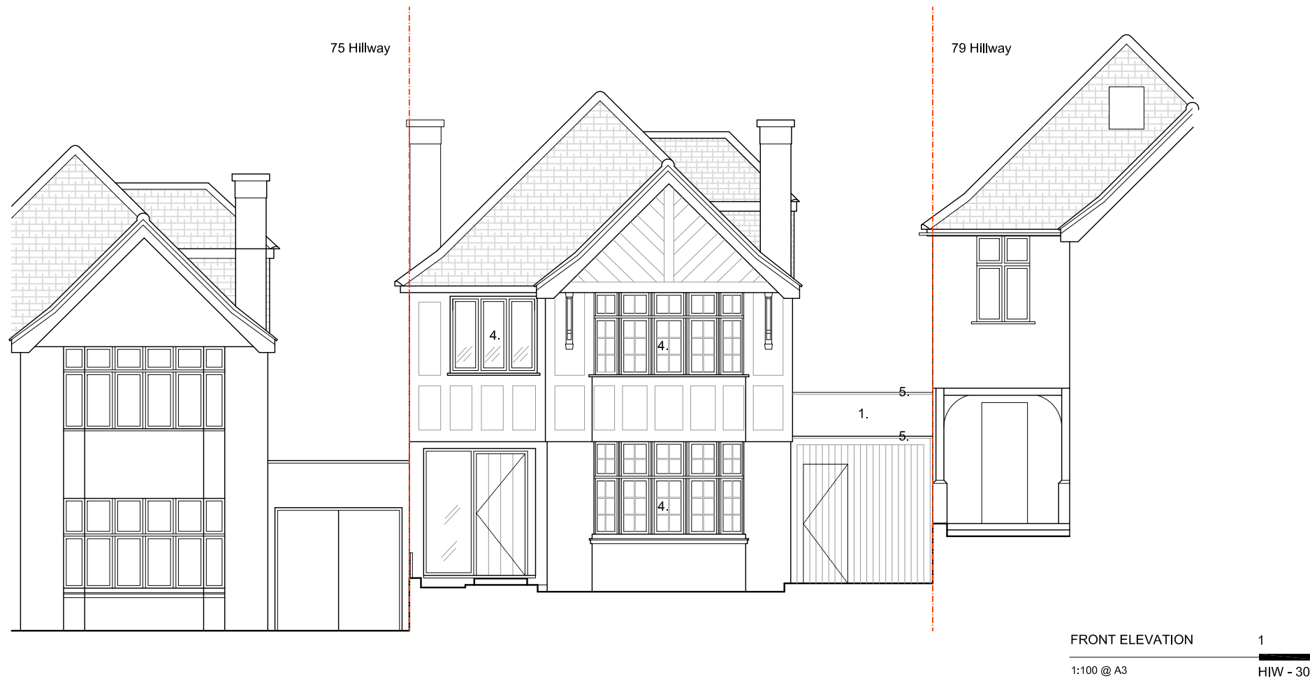
FRONT ELEVATION 1 1:100 @ A3 HIW - 301