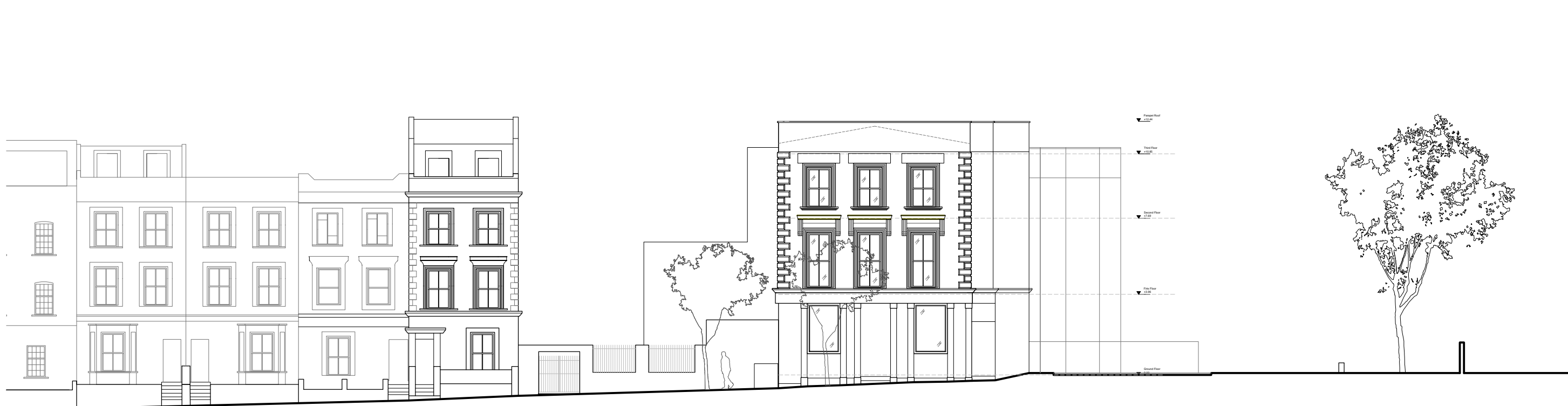
EXISTING ELEVATION ALONG TORRIANO AVENUE 1:200 @ A3