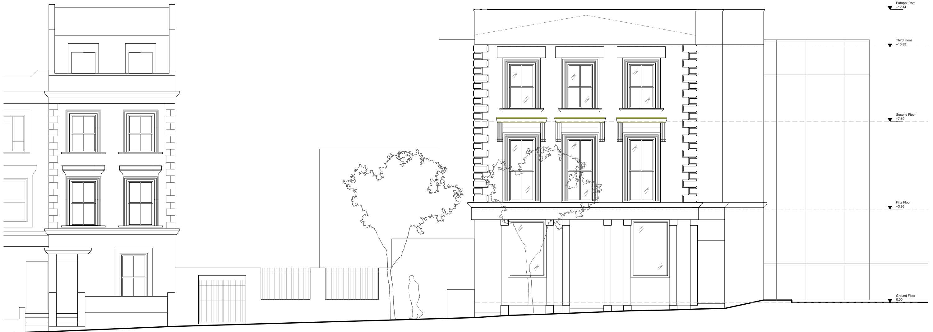
EXISTING ELEVATION ALONG TORRIANO AVENUE 1:100 @ A3