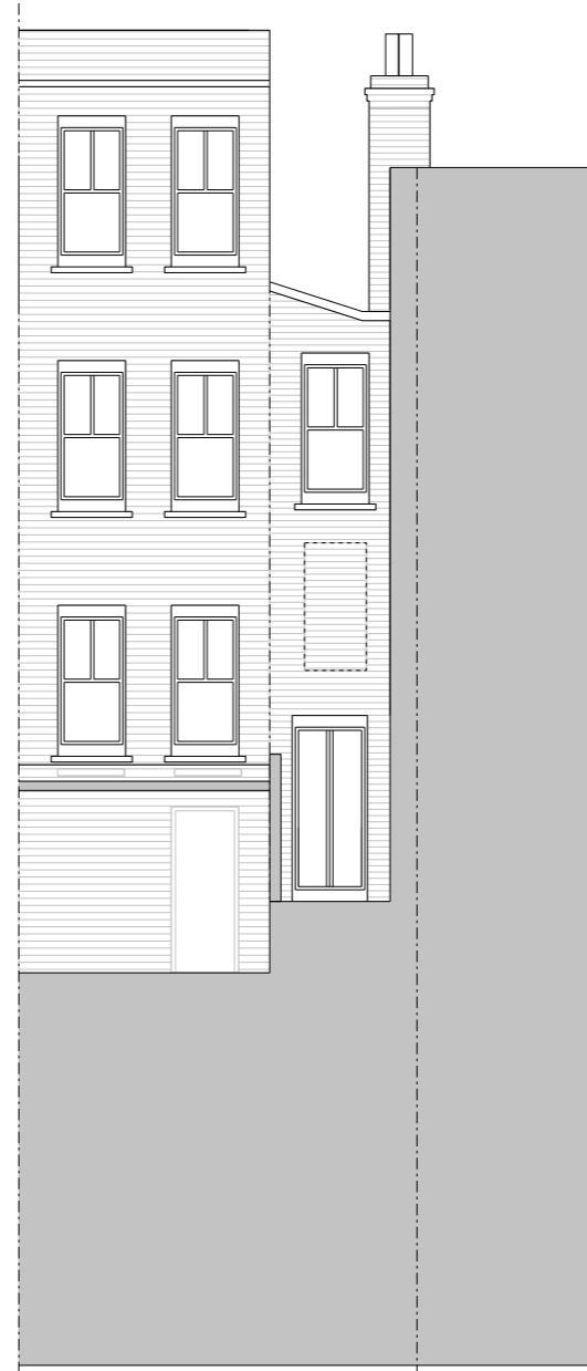
REAR ELEVATION 02