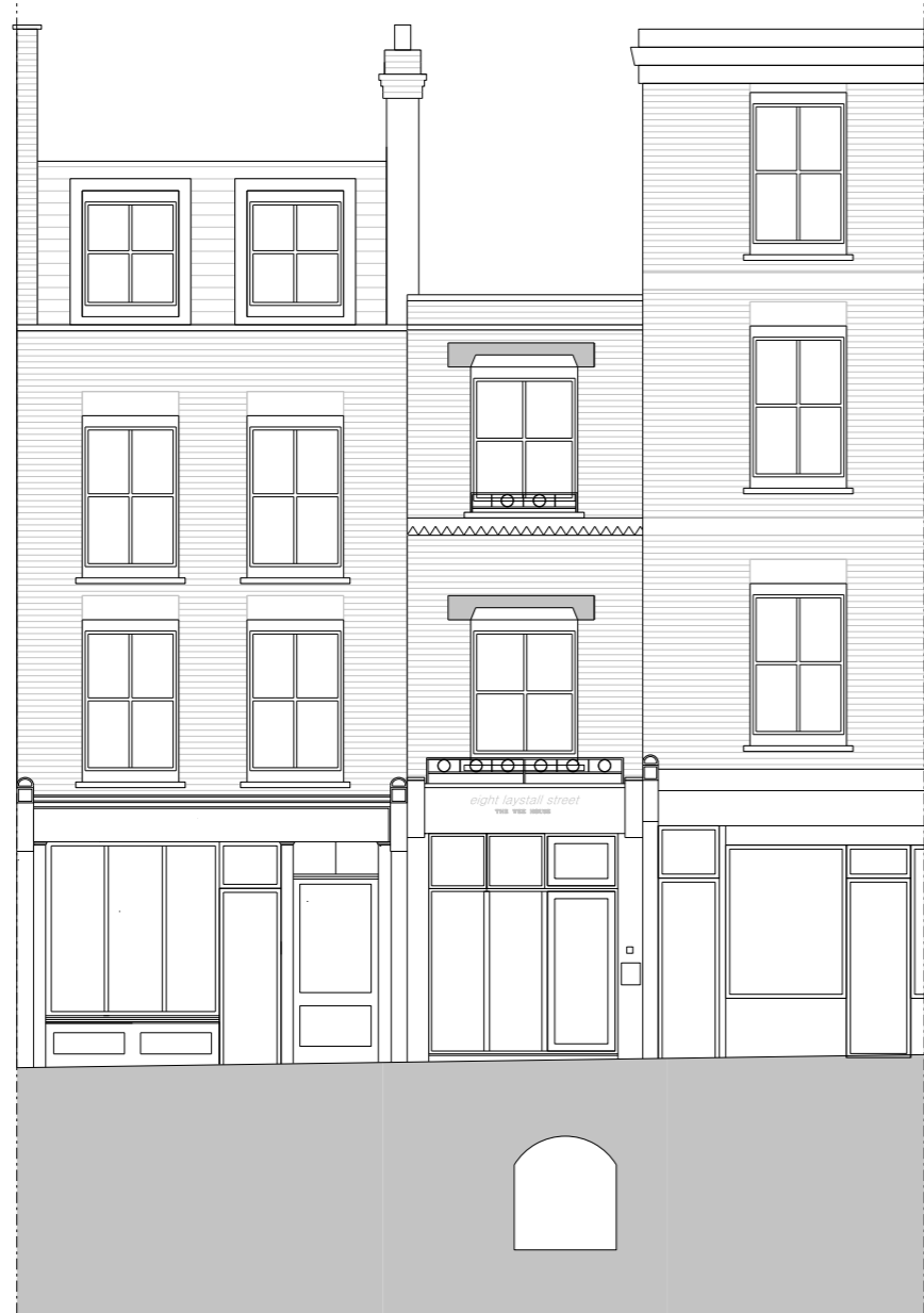
FRONT ELEVATION 01