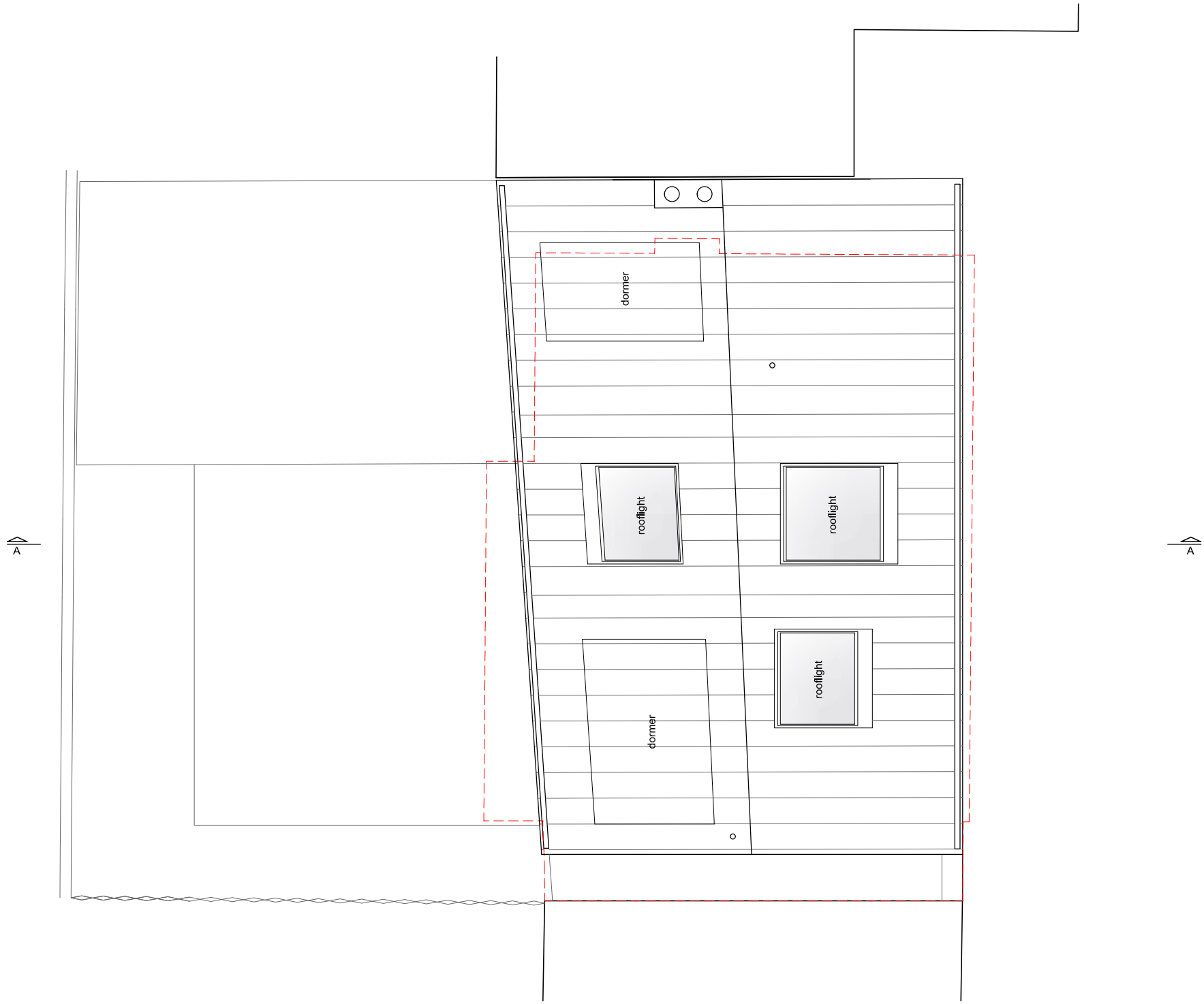
1 SECOND FLOOR PLAN Gross Internal Floor Area: 61.4 sqm approx