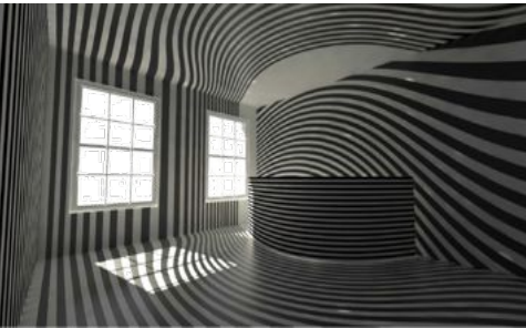
2D BLACK AND WHITE STRIPED PRINTED WALLPAPER FIXED TO FLOOR, WALLS, CEILING AND BAR.