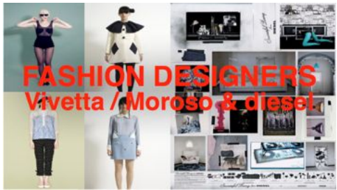
FASHION MEETS DESIGN IN CONTEMPORARY FORMAT.