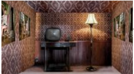
FINE ART PHOTOGRAPHY ONTO VINTAGE WALLPAPER.