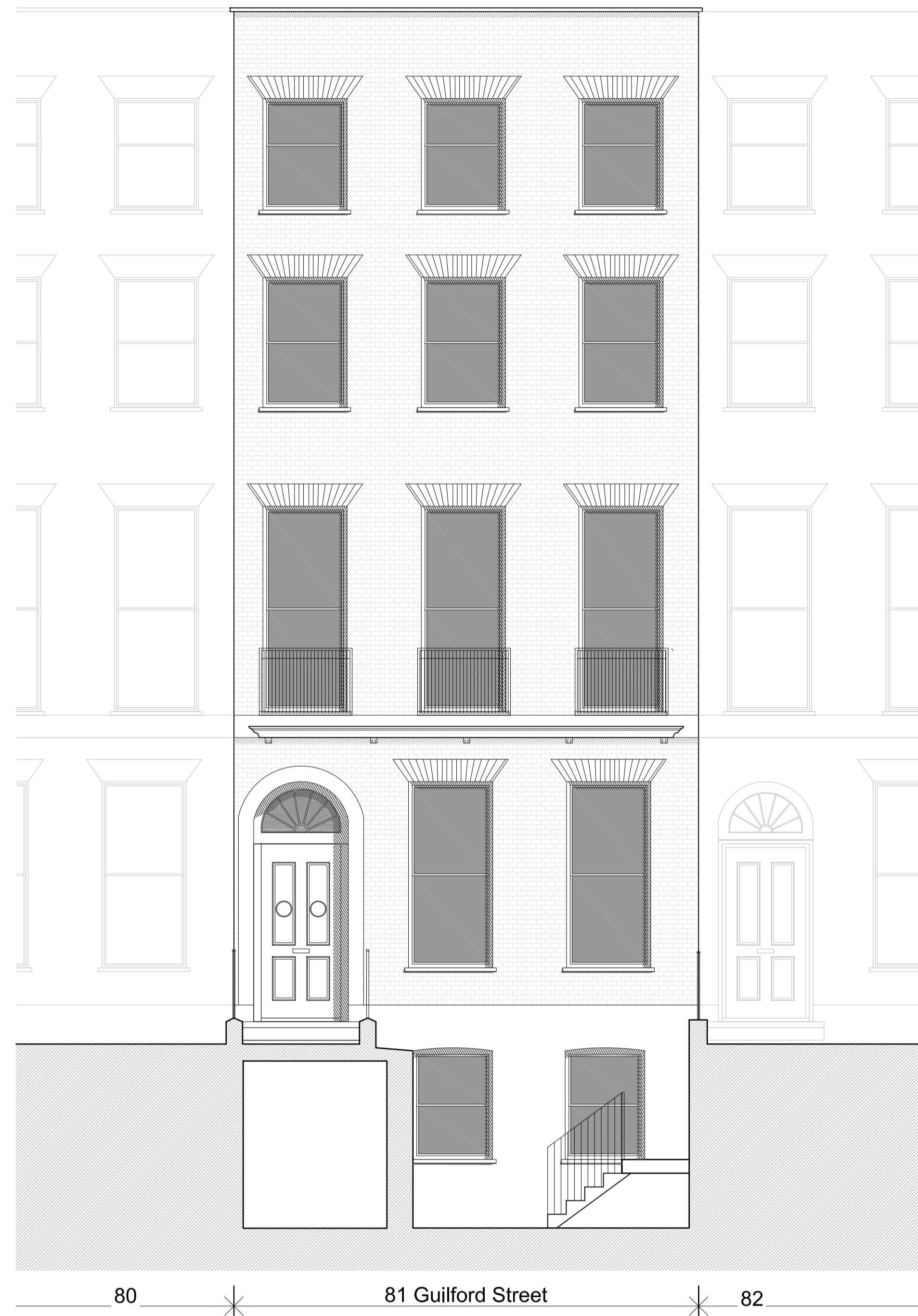
01 Front Elevation