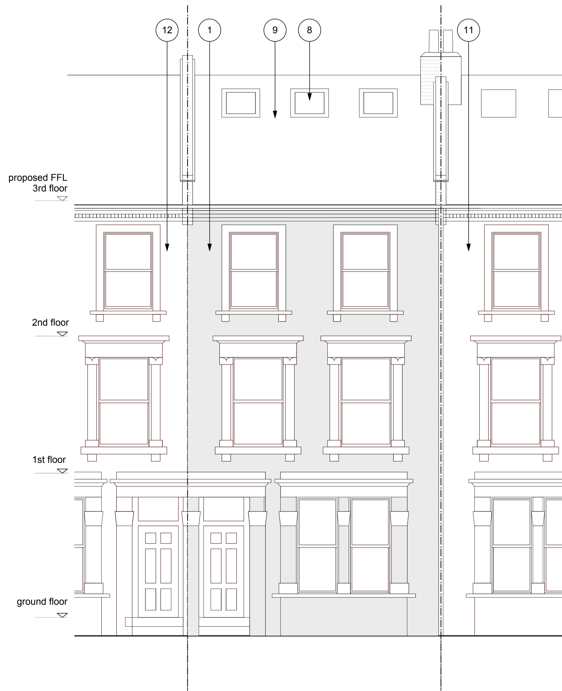
1 Proposed Front Elevation 1:50 @ A1