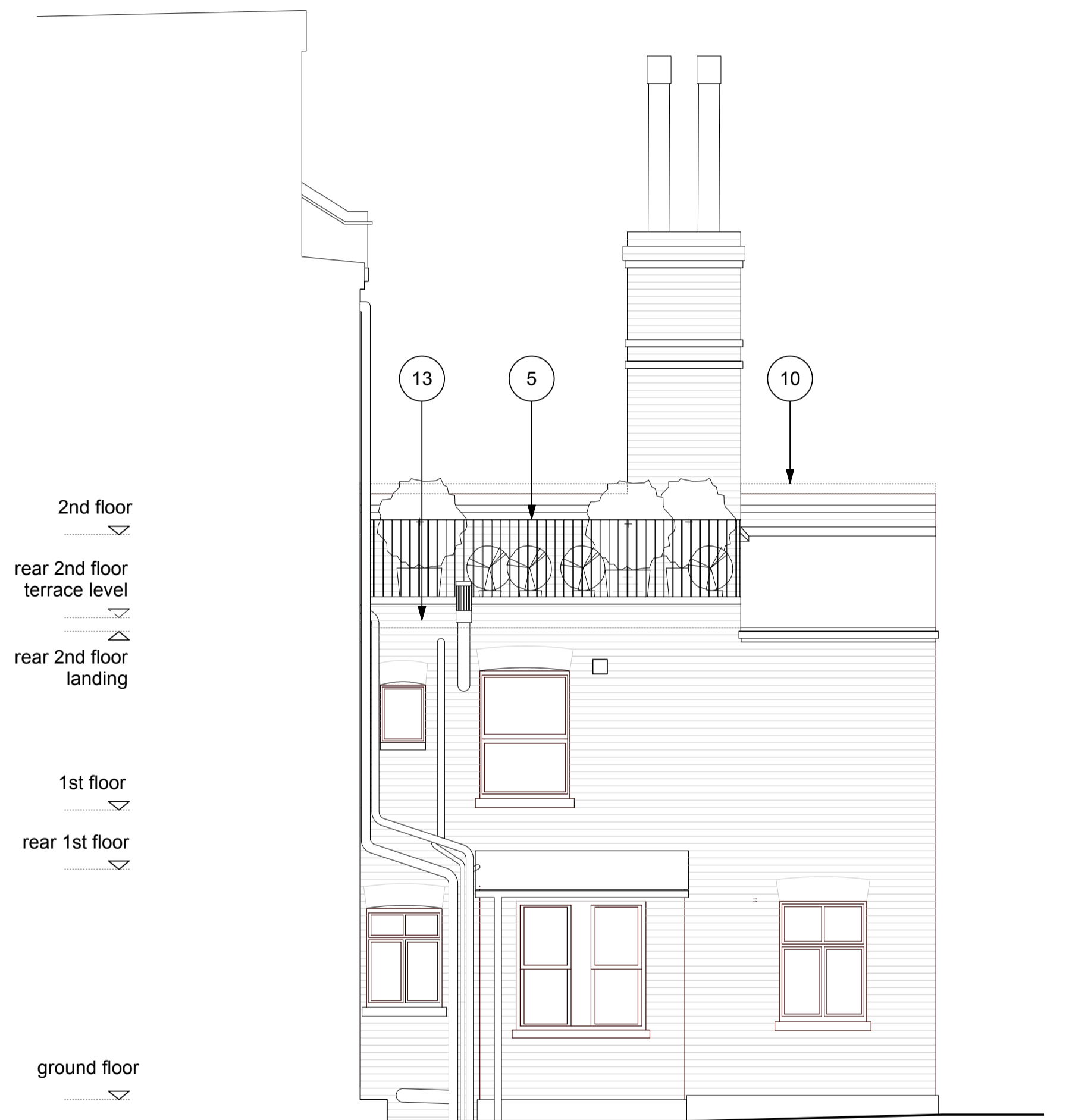
3 Proposed Side Elevation 1:50 @ A1

rev: - 20/01/2014 issued for comment A 24/04/2014 issued for comment B 02/05/2014 issued for information C 19/05/2014 updated as per client comment, issued for planning D 18/08/2014 updated as per planning comments: terrace and roof