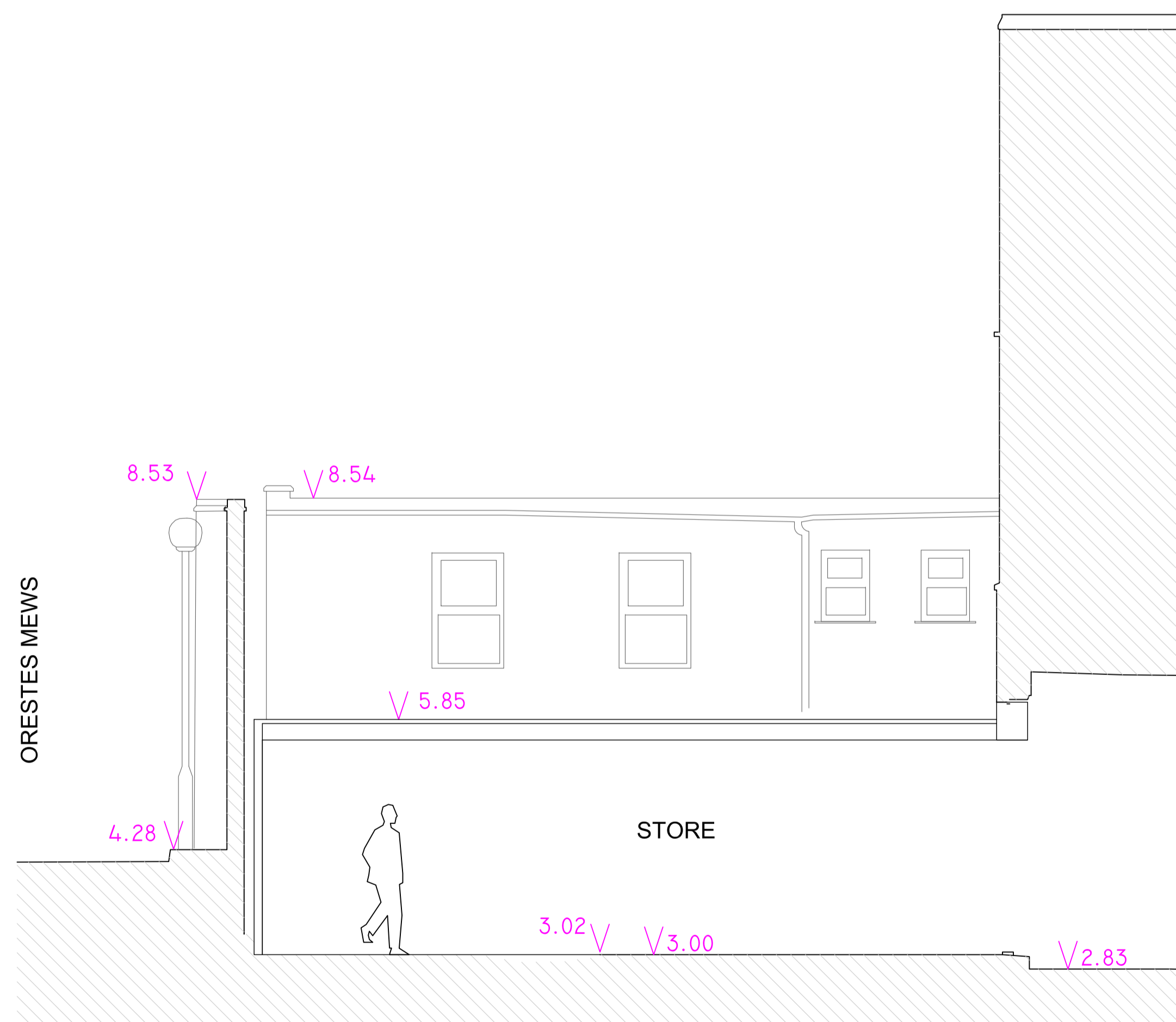
EXISTING SECTION AA