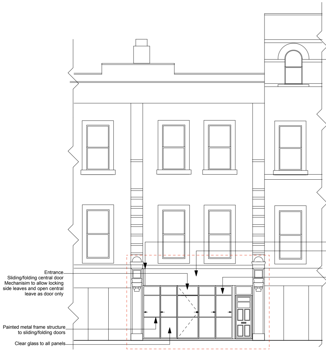
Front Elevation- Proposed

Entrance Sliding/folding central door Mechanism to allow locking side leaves and open central leave as door only Painted metal frame structure to sliding/folding doors Clear glass to all panels