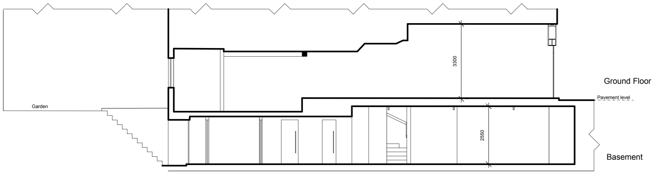
Section A- Proposed

WC air extract Fresh air fan inlet Air condensor units Painted metal frame structure to sliding/folding doors Clear glass to all panels