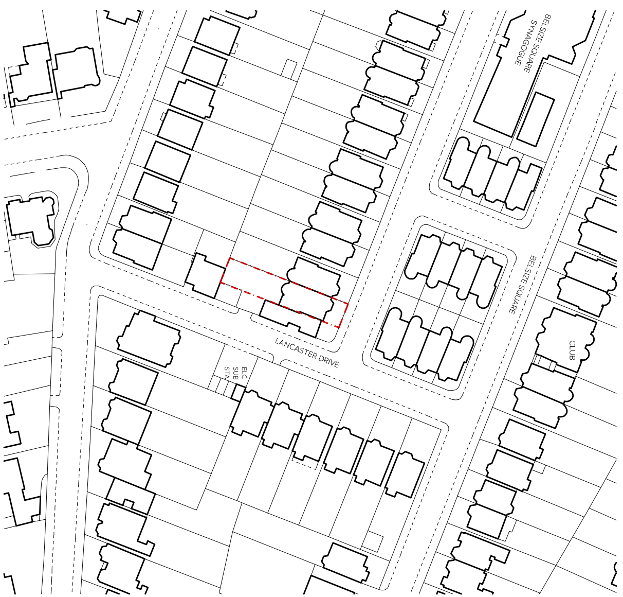
LOCATION PLAN 1:1250 @ A3