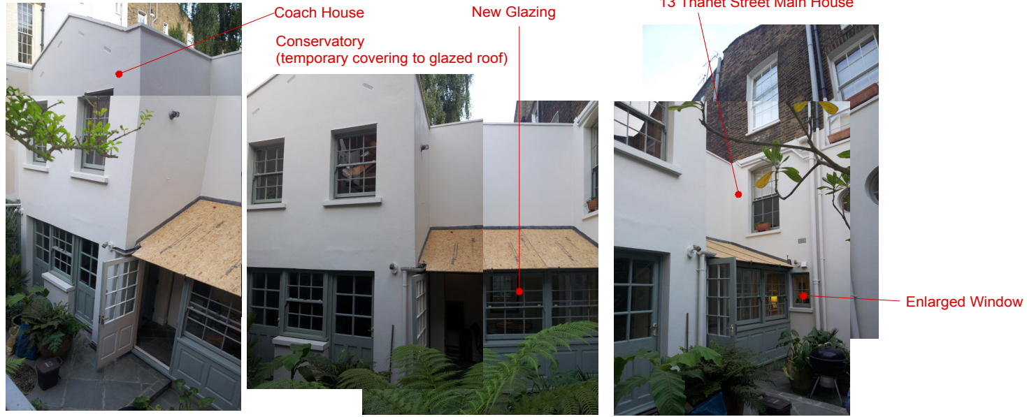
2 Site Images