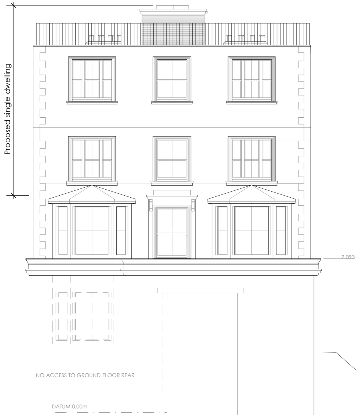
FLANK ELEVATION South West