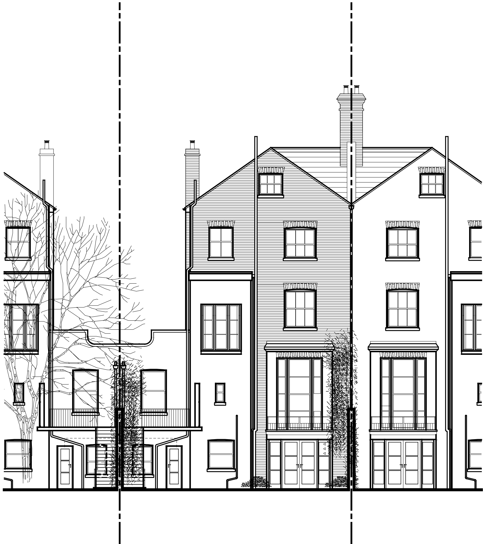
REAR ELEVATION AS EXISTING 1 : 100