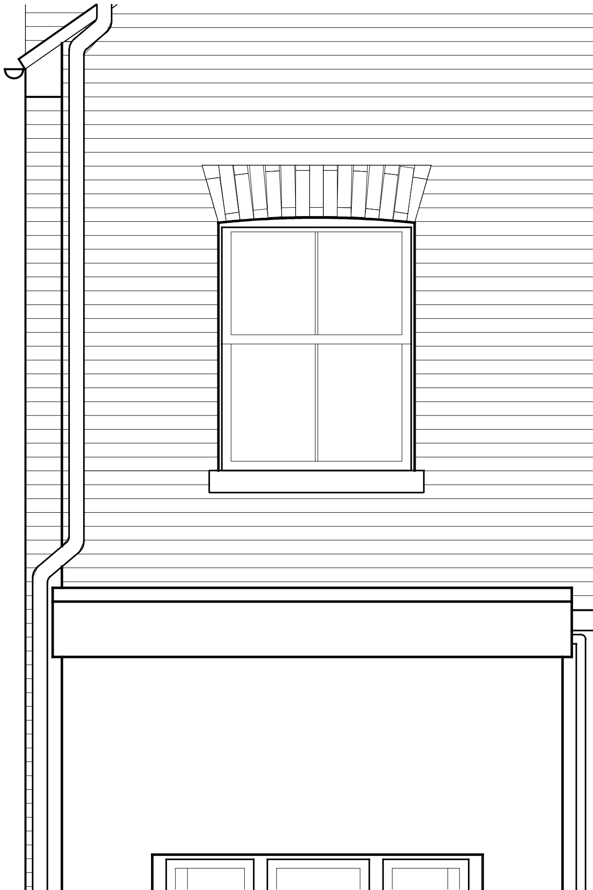
REAR ELEVATION (SECOND FLOOR) 1 : 20