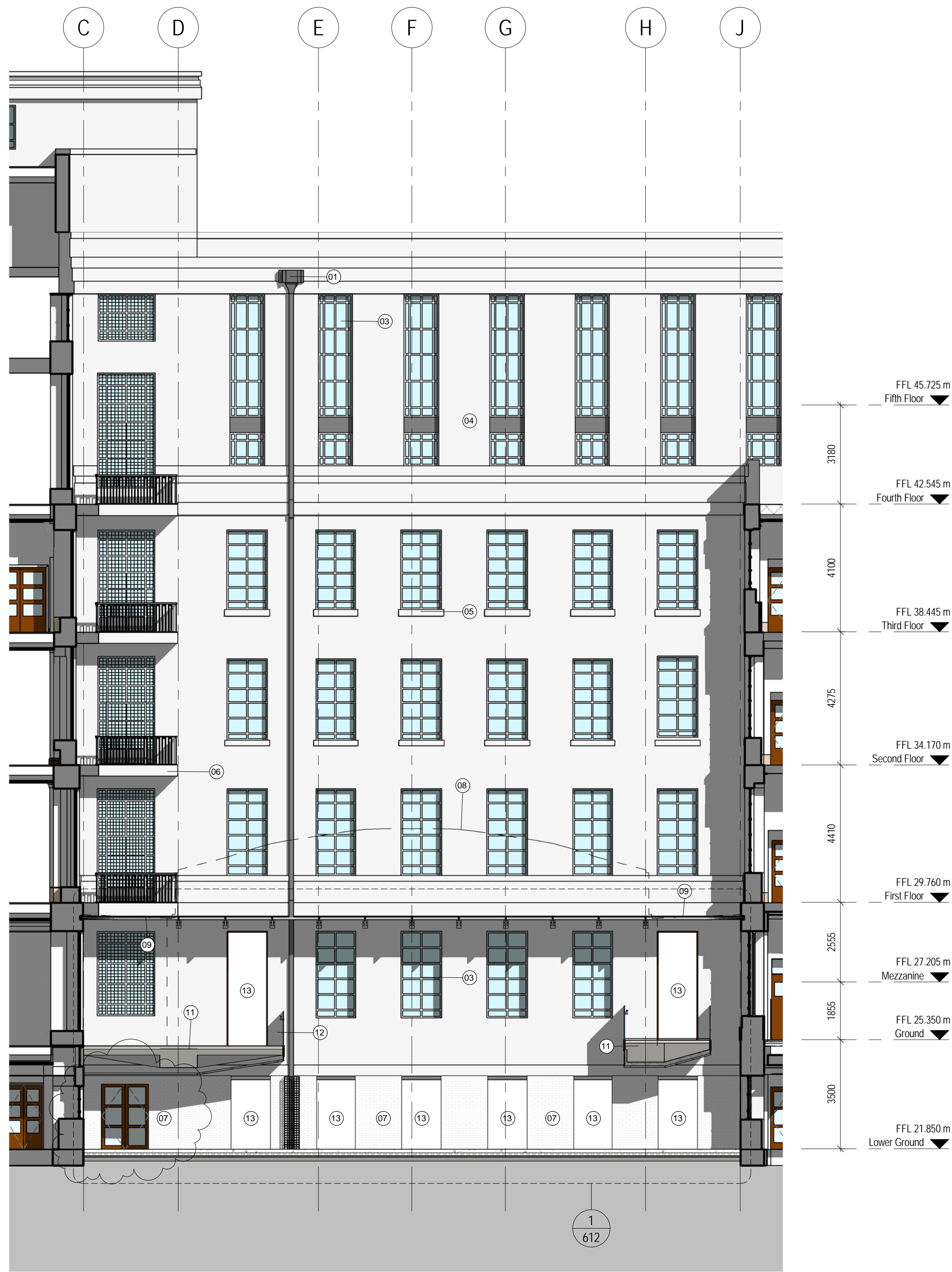
2 PROPOSED ELEVATION INTERNAL NORTH 1:100

© COPYRIGHT Mace Group NOT TO BE REPRODUCED WITHOUT WRITTEN PERMISSION. BECAUSE OF POSSIBLE SCALING ERRORS IN ELECTRONIC AND HARD COPY REPRODUCTION DO NOT SCALE FOR CONSTRUCTION PURPOSES. ALL DIMENSIONS TO BE CHECKED & VERIFIED ON SITE PRIOR TO CONSTRUCTION.