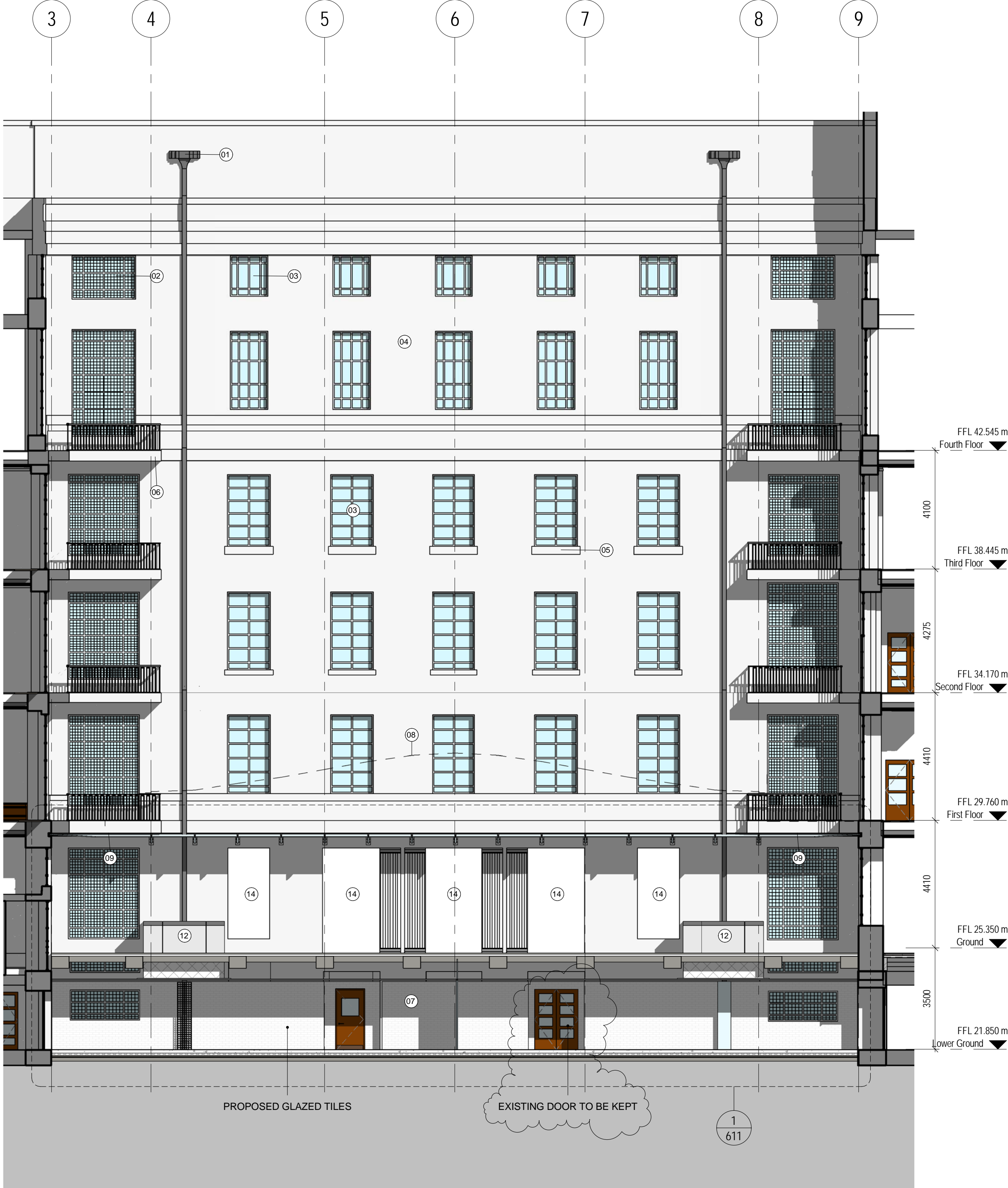
1 PROPOSED WEST COURTYARD ELEVATION 1 : 100