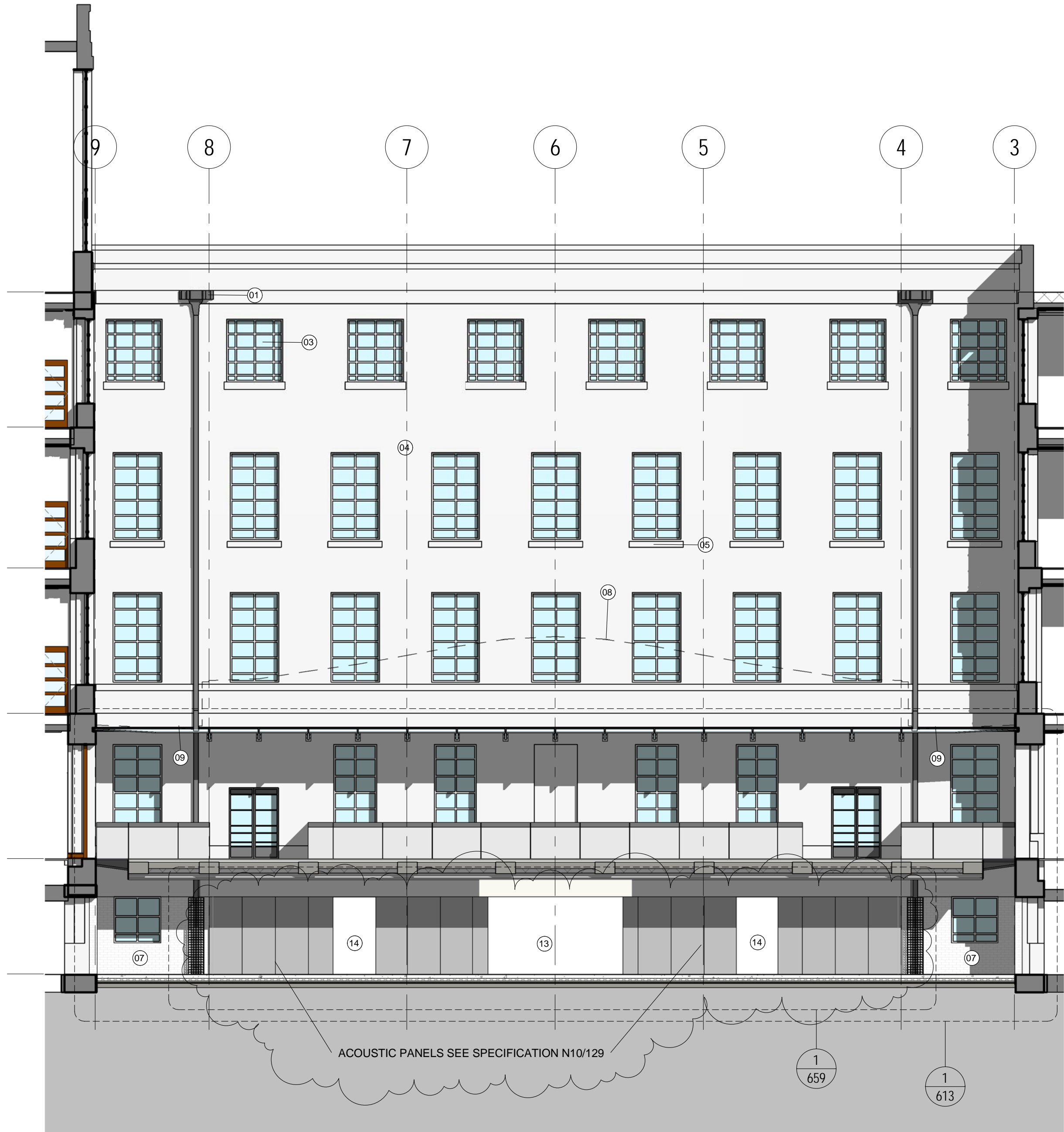
2 PROPOSED EAST COURTYARD ELEVATION 1 : 100

© COPYRIGHT Mace Group NOT TO BE REPRODUCED WITHOUT WRITTEN PERMISSION. BECAUSE OF POSSIBLE SCALING ERRORS IN ELECTRONIC AND HARDCOPY REPRODUCTION DO NOT SCALE FOR CONSTRUCTION PURPOSES. ALL DIMENSIONS TO BE CHECKED & VERIFIED ON SITE PRIOR TO CONSTRUCTION.