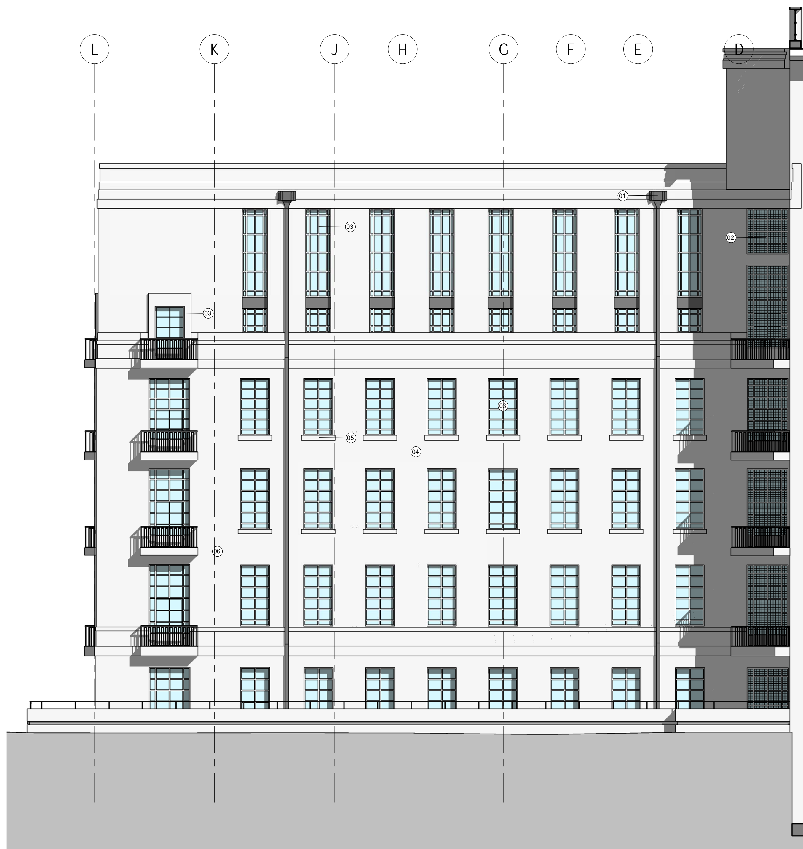
1 PROPOSED ELEVATION SOUTH 1 : 100