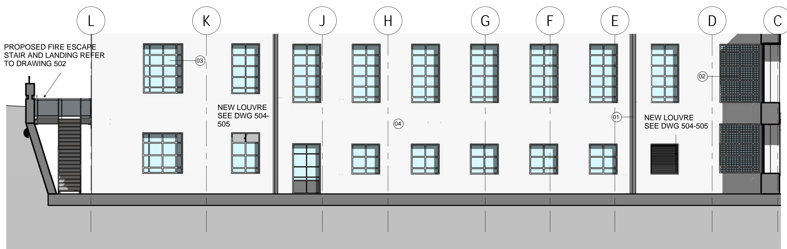
2 PROPOSED ELEVATION SOUTH THROUGH LIGHT WELL 1 : 100