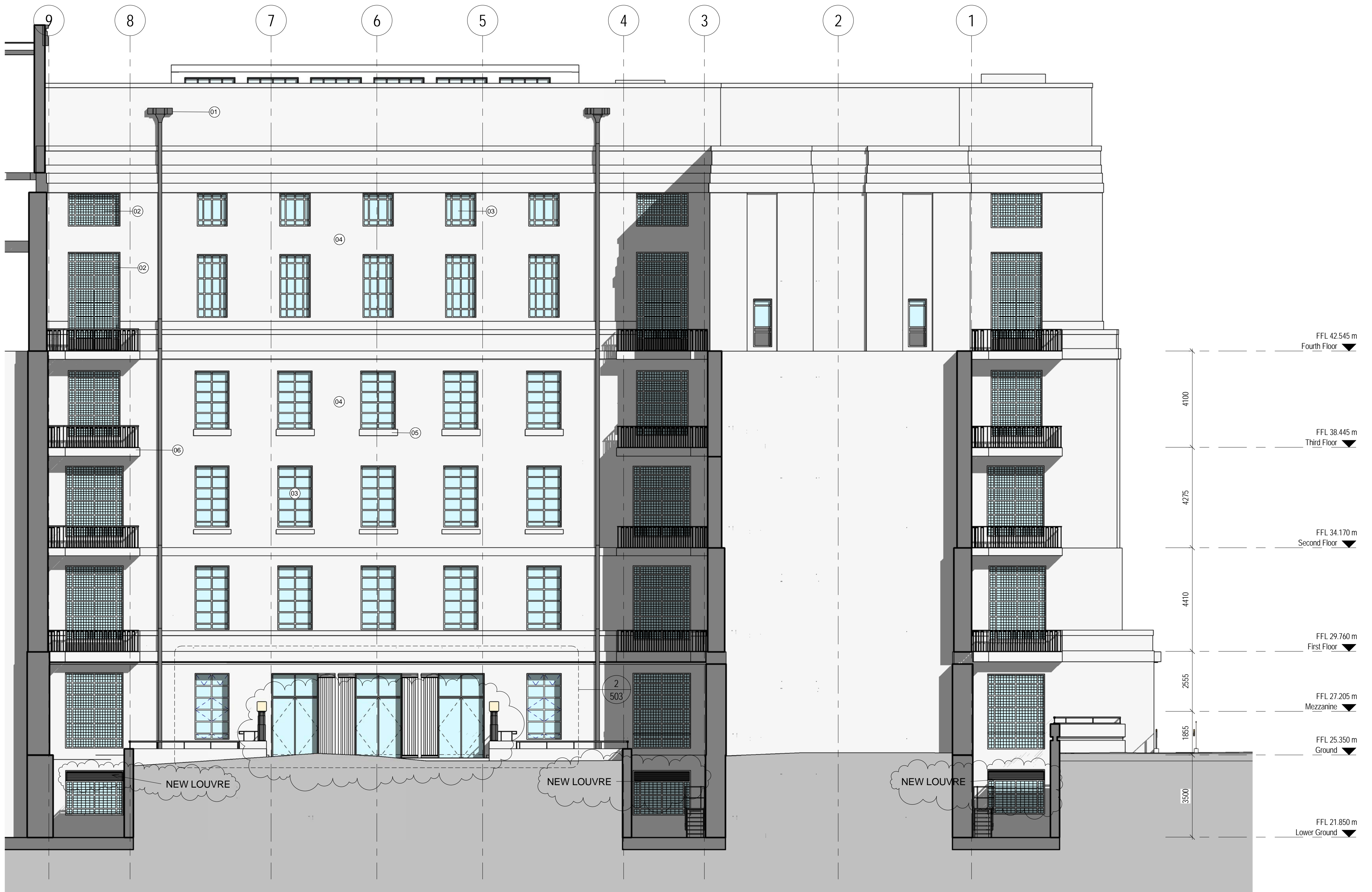
1 PROPOSED ELEVATION EAST 1 : 100