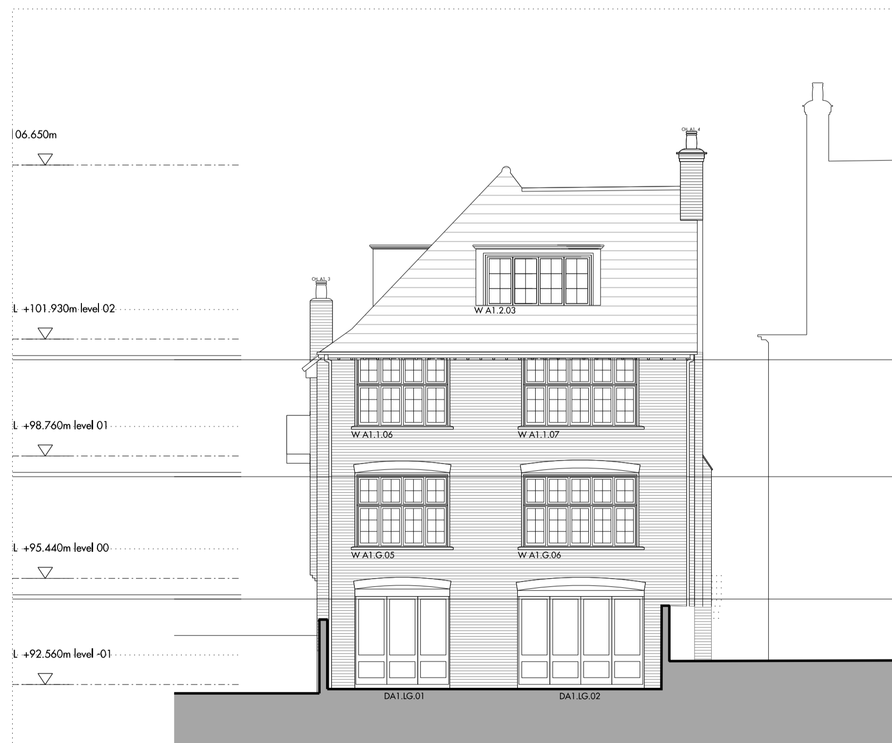
03 BLOCK A1 / SOUTH-WEST ELEVATION PRIVATE GARDEN