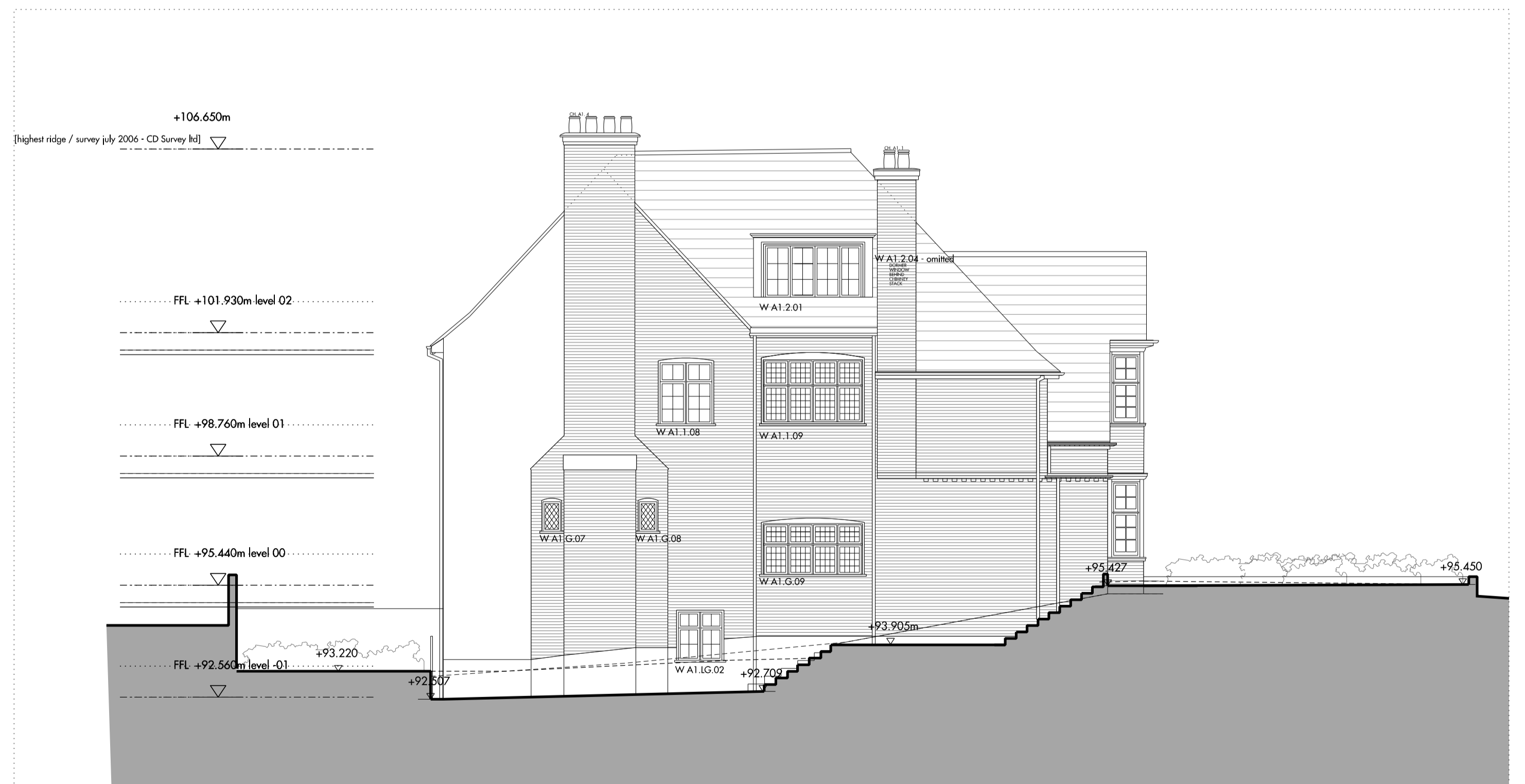
04 BLOCK A1 / EAST ELEVATION SIDE