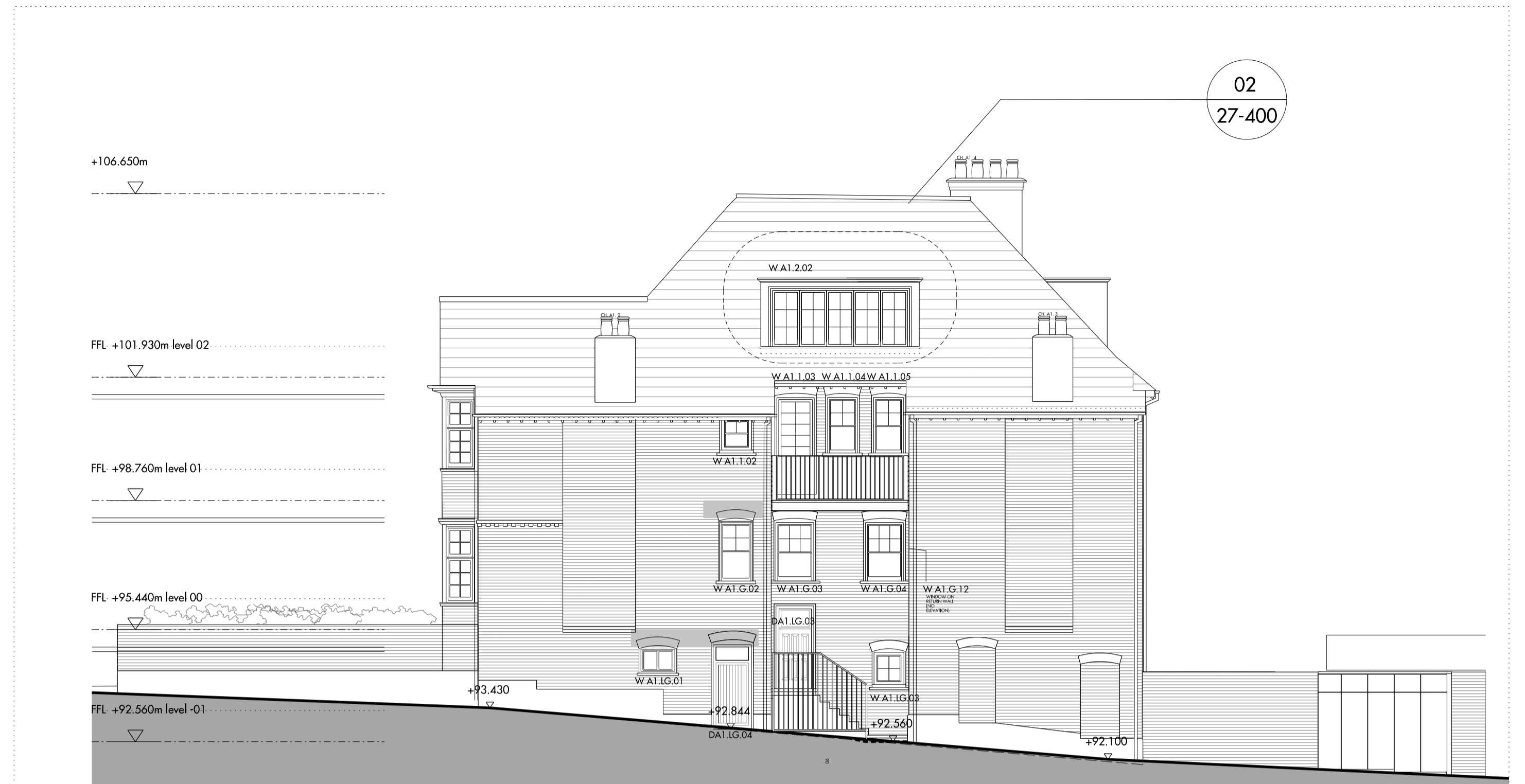
02 BLOCK A1 / NORTH-WEST ELEVATION KIDDERPORE WALK